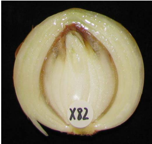
Figure 1. Inner scale(s) of onion bulb is infected with bacterial decay, while outer scales remain firm making detection on grading line challenging.