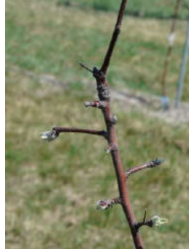
Liberty (late GT/early HIG)