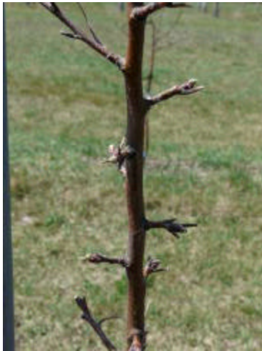
Honeycrisp (early GT)

Stage of Development: [from least developed to more advanced bud development]