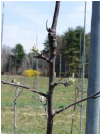
Ginger Gold (early HIG)