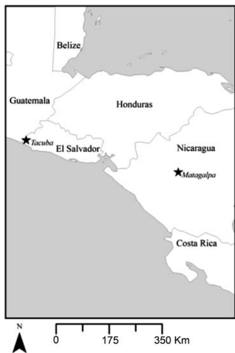
Figure 2 Location of Tacuba, El Salvador, and Matagalpa, Nicaragua.

and soils are predominantly volcanic Andisols (MARN 2003). The cooperatives were located in or near the buffer zone of El Imposible National Park, one of the largest protected natural forests in the country.