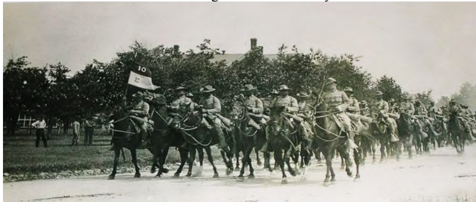
The 10 th Cavalry leaving Fort Ethan Allen, VT for Pine Plains, NY 1913

Vermont Buffalo Soldiers 100 th Anniversary Celebrating Vermont's History