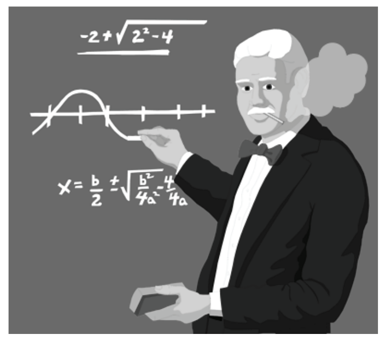
The Math Dept. Smokes Chalk