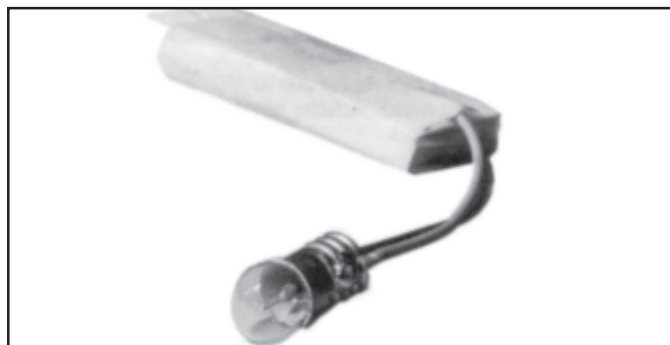
400-8318 Pilot Balloon Light