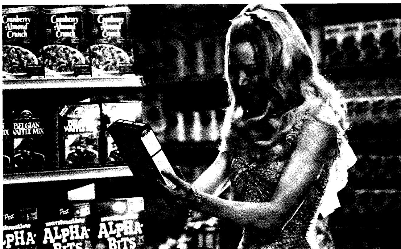
Nicole Kidman in Stepford Wives (2004)

same sense that communism is an ideology. Is that really what you mean? Or is "consumerism" just another word for the powerful forces of desire and clinging, which have been around for as long as there have been human beings? An ideology is a set of ideas that drives action. In the case of the consumerist ideology, the ideas are discussed in corporate board meetings and in advertising suites and in government offices, and they shape decisions about which ads will be placed where and why, and who will control which communication mechanisms, and what kind of energy sources will be developed and which will not, and who will decide the fashions for a preteen kid. The ideas are about getting people to buy stuff, and thus about making money. So that is a reigning ideology—to drive profits up, and to find consumers wherever one can. Consumerism becomes a whole way of seeing the world. And of course, yes, it's built on desire at the individual level. But on top of that, the ideology is saying, "Let's produce desire for more things. And the more desire we produce, the more profits we will make."