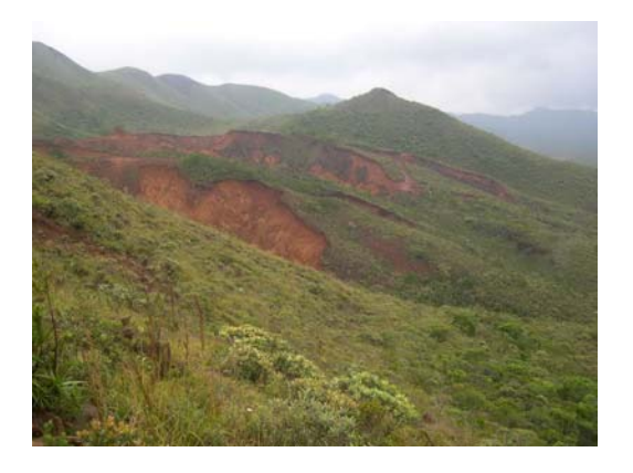
Plate 3: Erosion from Historic mining Activities in Southern Provincee