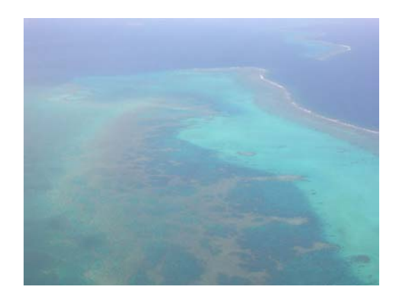
Plate 2: New Caledonian Coral Reef