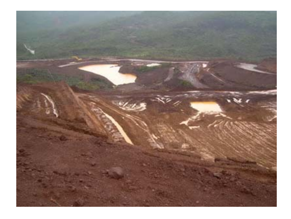
Plate 5: Construction of Processing Plant at Goro