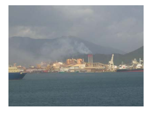
Plate 1: The Doniambo Nickel Smelter