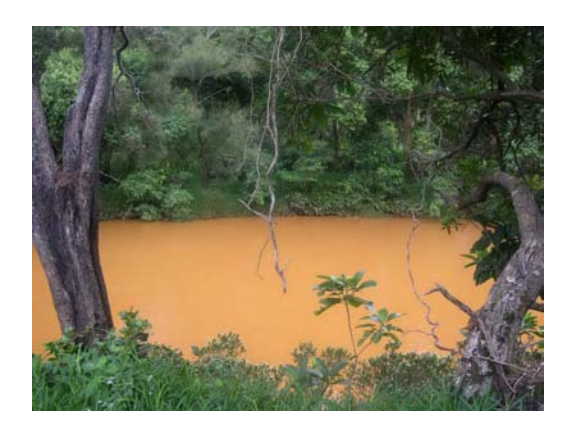
Plate 4: High sedimentation in central river system due to erosion from mining in Northern Province