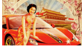
The Ferrari With the Dragon Tattoo