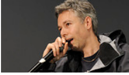
Beastie Boys Rapper Adam Yauch Dies at 47