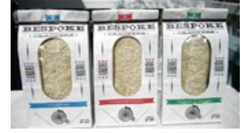
Nothing Speaks Like 'Bespoke' Outfits