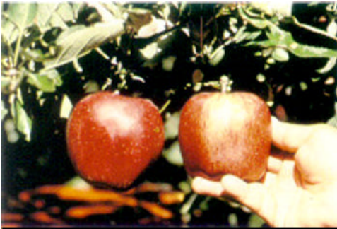
Effect of K Shortage on Apple Color Left Sufficient K Right Deficient K

Adequate potassium contributes to improved fruit size, color and flavor. It is also a major factor in reducing winter injury, spring frost damage to buds and flowers, and generally reduced incidence of diseases. The benefits of adequate potassium can be lost however, if the leaf ratio of nitrogen to potassium (N divided by K) is too high. Low N trees such as McIntosh do better with an N:K ratio of about 1:1 to 1.25:1, while high N trees such as Red Delicious should have a ratio of about 1.25:1 to 1.5:1. Where leaf analysis shows N and K are sufficient, but the ratio is high, the annual K_2O should be increased to correct the leaf balance.