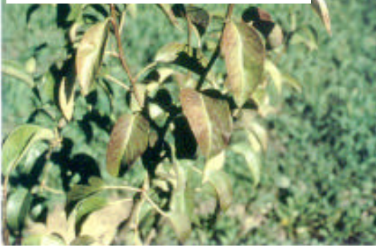
Figure 2: Phosphorus

The status of an orchard soils P supplying power can be difficult to determine, even with the best soil testing program. Fruit trees are deep rooted and can absorb P throughout a deeper soil profile than annual crops. Therefore they are using soil P that isn't identified by normal soil sampling. Apple trees also absorb P over a long portion of the year, and most soil test calibration assumes a somewhat shorter uptake period. Of course other soil factors such as pH, temperature, moisture, compaction, etc. (at all rooting depths) also affect P uptake. With all of these complications, it may seem futile to take a soil sample, however it remains a fact that a healthy tree will take up more P from a high testing soil than a low one, so periodic soil testing is still a recommended practice. These complications with trees