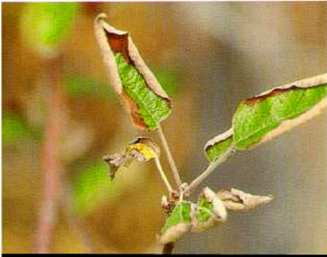
Potassium Deficient Apple