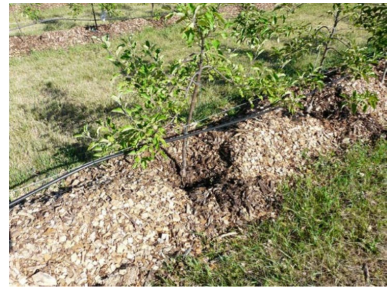
Figure 7. Mulched tree rows in a high-density organic orchard.

Wood chips are probably the best organic mulch, and can often be sourced from municipal tree companies for relatively low cost or even for free. There is some concern that wood chips applied to the soil will tie up nitrogen, but that is debatable, and likely would only happen