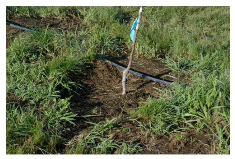
Figure 4. Weed-free area maintained around newly-planted trees via handhoeing

Tractor-mounted under-tree cultivators come in many makes and models. Cultivators with hydraulically-powered rotating tines may be useful for many orchard practices, including hilling up soil, removing berms in the tree middle, breaking up established sod, and general cultivation. However, their aggressive nature requires very careful operator attention and slow ground speeds which may limit their use in large plantings.