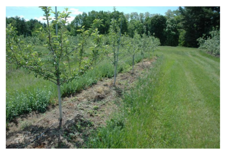
Figure 1. Weed-free strip maintained under a young orchard.

Apples have relatively deep roots compared to many weed species. However, changes in orchard architecture to favor dwarf rootstocks with shallow root systems make those trees less competitive with weeds than older, larger trees on semidwarfing or larger rootstocks. For those larger, established trees, a sod groundcover mowed with an offset mower may be acceptable, however, grasses and other covers growing under the trees may compete for water and nutrients and reduce crop yield and/or tree growth in subtle but measurable ways. Even deep-rooted semidwarf trees will benefit from reduced weed competition during orchard establishment.