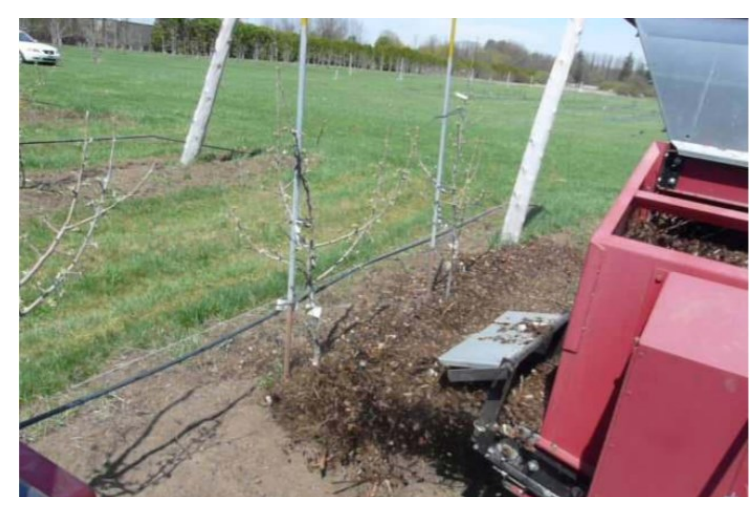
Figure 8. Mulch application with Mill Creek spreader, Honey Brook, PA

Because wood mulches are composed of the similar tissues as apple trees, they often contain nutrients in roughly the quantities required in orchards.