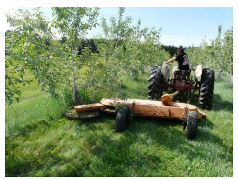
Figure 2. Mowing semidwarf trees with a swing-arm mower.

The orchard row middles typically require mowing several times per year to provide access through the planting for workers and equipment, to reduce vole habitat, and to reduce moisture in tree canopies. Mowers with a spring-or hydraulic-activated swing arm may be used to mow vegetation under trees and even up close to the tree trunks. Mowed sod systems are only recommended for vigorous trees and in non-droughty soils. However, swing arm mowers may be used to maintain lateseason vegetation allowed to grow in late summer and fall to prevent complications resulting from excessive vegetation growth. In some cases, 'brushing out' trees with weed whackers or machetes is necessary to control vegetation close to tree trunks or in the narrow band between trees.