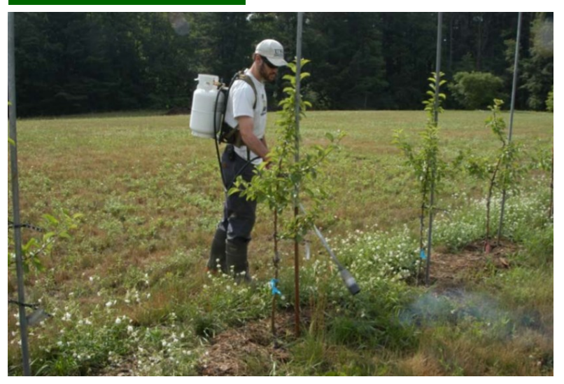
Figure 3. Backpack flame weeders are relatively inexpensive and can spot-treat problem weeds but can start fires if not very carefully used.

Propane-fueled flame weeders are used successfully in some crops to manage weeds. The flame need not burn the whole plant, but must only raise the temperature enough to rupture cells which leads to plant death. This can be achieved with a quick pass over the plants. However, this only kills the tops of plants and many weed species will quickly regrow from the roots. Also, flame weeding can damage low limbs and tree trunks if not applied very carefully. There is also danger of starting fires in dried thatch and other vegetation and damaging irrigation lines. Generally, flame weeding is not particularly effective in most orchard systems.