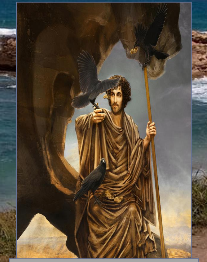
Prophet With the seeing abilities of Tiresias