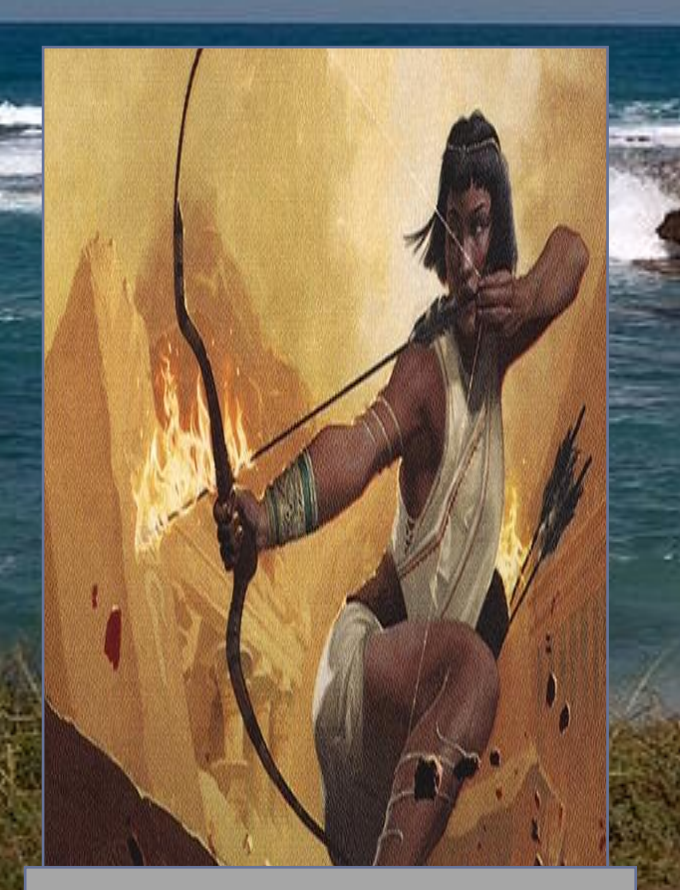
Archer With bow abilities like Teucer