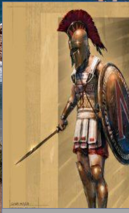
Warrior With the fighting skills of Diomedes