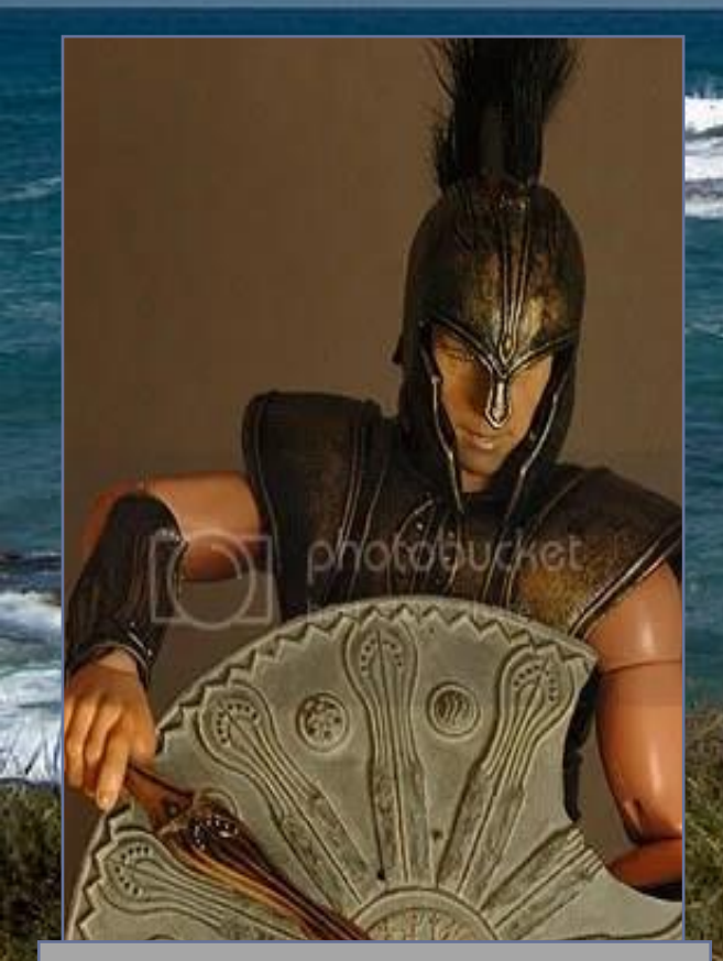
Hero The power of swift footed Achilles