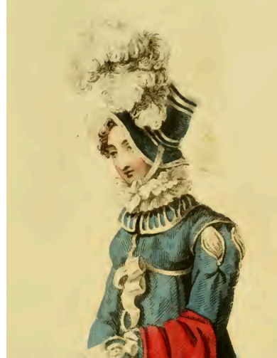
December 1815, Walking Dress