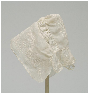
1800-1820 Embroidered mull (fine cotton)