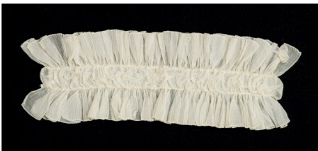
c1815 Snowhill Museum