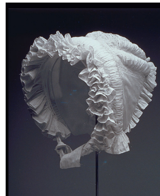
1825-30 McCord Museum lawn, M9677