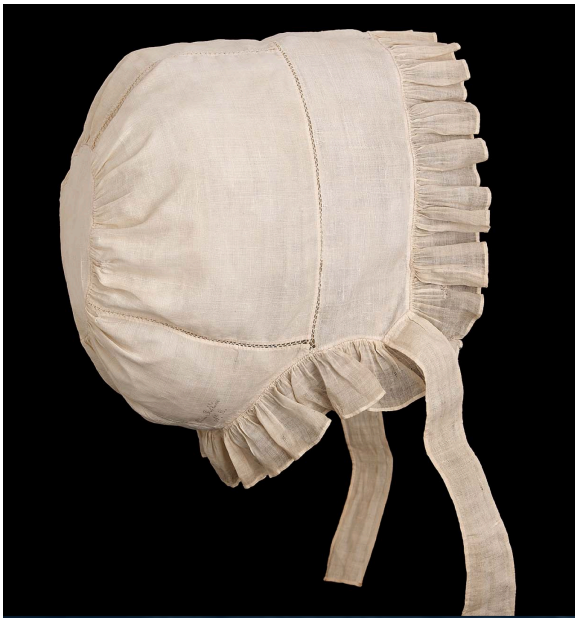
A simple linen cap. Fine Arts Museum, Boston. 99.664.31

Throughout this period it was the standard for women, particularly adult women, to wear caps. These could be made of fine lawn, mull, or tulle—that is, with cottons that were semi-transparent. More rare, for high fashion daytime wear at least, are caps made of linen. Caps, too, followed the fashion and accommodated current hairstyles. Early 19 th century hairstyles, and the caps that covered them, tended to pull the volume of the hair to the back of the head in 'Grecian' style. Caps from this era tend to lie close to the head on top and be longer at the back. As the century progressed that volume moved to the top of the head in 'Roman' style, becoming more detailed. Caps from this era leave room on top. Like the movement towards more ornate bodices, caps, too, became more ornate as the century progressed, trying to keep pace with the amazing styles of the 1830s.