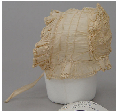
1800-10 Metropolitan Museum of Art, 1979.346.86

Band: widest points 8" x 24" Crown: 6" x 7"