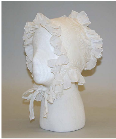
1812-18 Metropolitan Museum of Art, C169.32.16C169.32.16

Band: approx 8 x 26" Crown: approx 7" x 7"