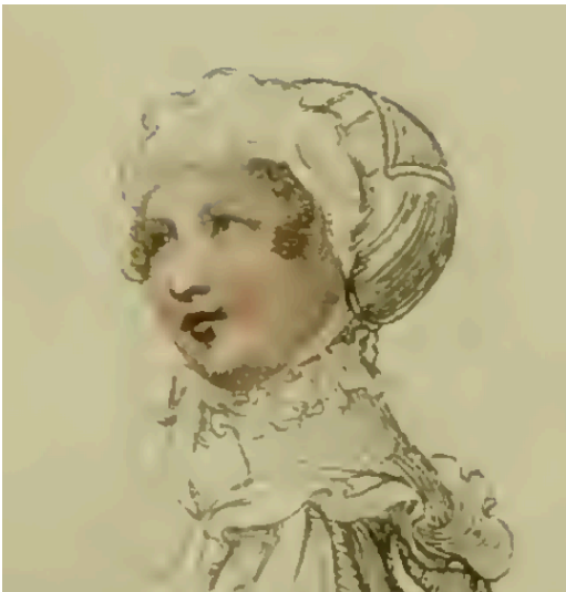
November 1810, Morning Dress

Full issues available at: https://archive.org/search.php?query=ackermann%20repository