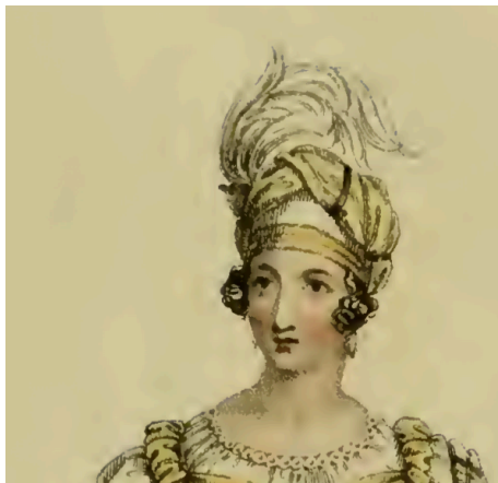
April 1818, Evening Dress (Cambridge Toque)