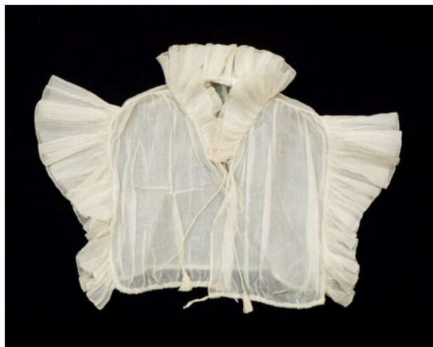
1820-25 Snowhill (meant to be worn over gown)