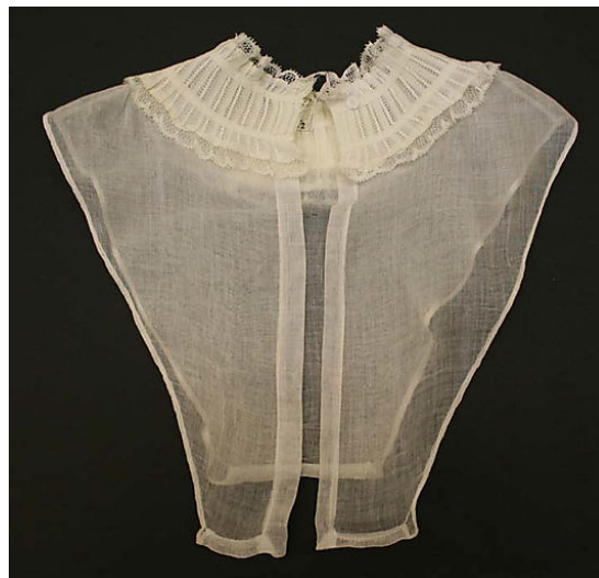
c1818 Metropolitan Museum of Art