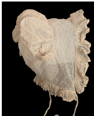
c1814 Fine Arts Museum, Boston, 46.1242