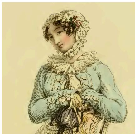
October 1811, Carriage or Morning