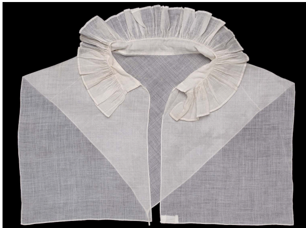
Museum of Fine Arts, 99.664.46