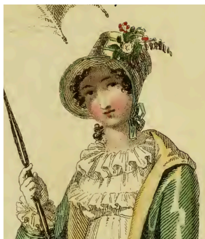
May 1815, Walking Dress