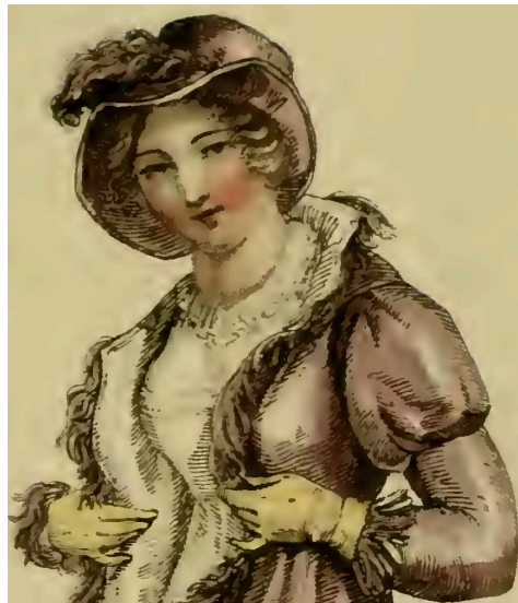
April 1811, Walking Dress