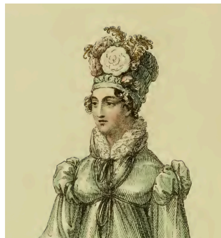
June 1818, Walking Dress (Collarette, Toque)