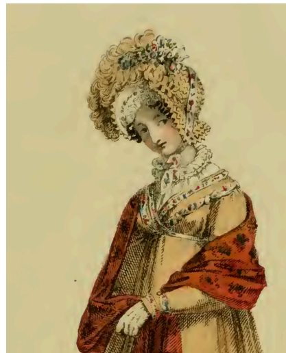
March 1818, Walking Dress