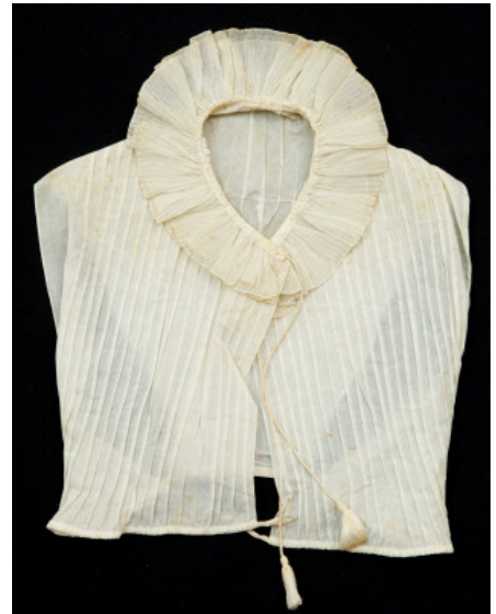
1815 Chemisette, Snowhill Museum, 1349950.

The objects followed the fashion evolution of the time. Early chemisettes were plain with either no collar or a simple collar. As the century progressed these became more elaborate, with tucks, pleats, ruffled necklines or wider collars edged with lace or ruffles. After about 1812 when fashion demanded more elaborate bodices to balance the elaborate borders on skirts, and outer garments like spencers or pelisses followed suit with wider or taller collars, both chemisettes and detached ruffs, or frills as they were often called, developed even more layers and height to fill in the neckline. The chemisette continued to be worn throughout the 19 th century and the shape and collars continued to follow the general design of the dresses with which they were worn.