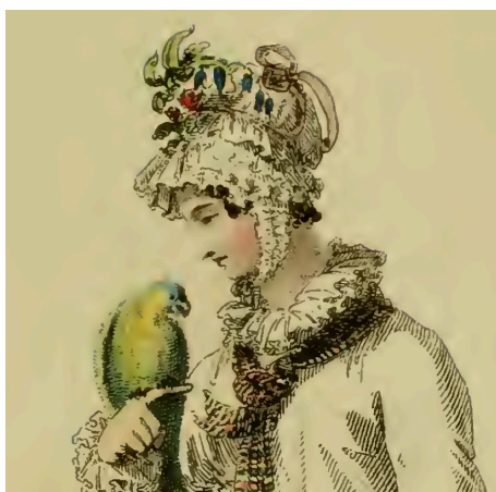
April 1815, Morning Dress