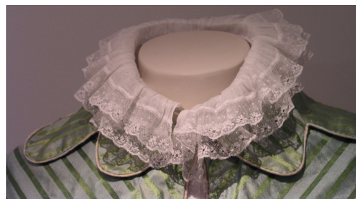
1810-20 Museum of London