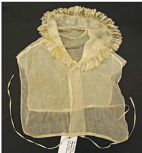
c1815 Vintage Textiles