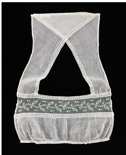
1815-20 Museum of Fine Arts