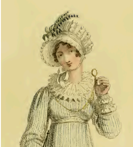
August 1815, Walking Dress