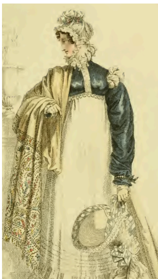
October 1818, Walking Dress