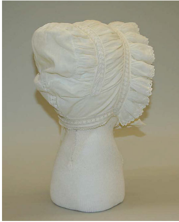
1812-20 Metropolitan Museum of Art C137.45.16