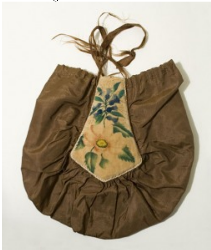
1810s Vintage Textiles