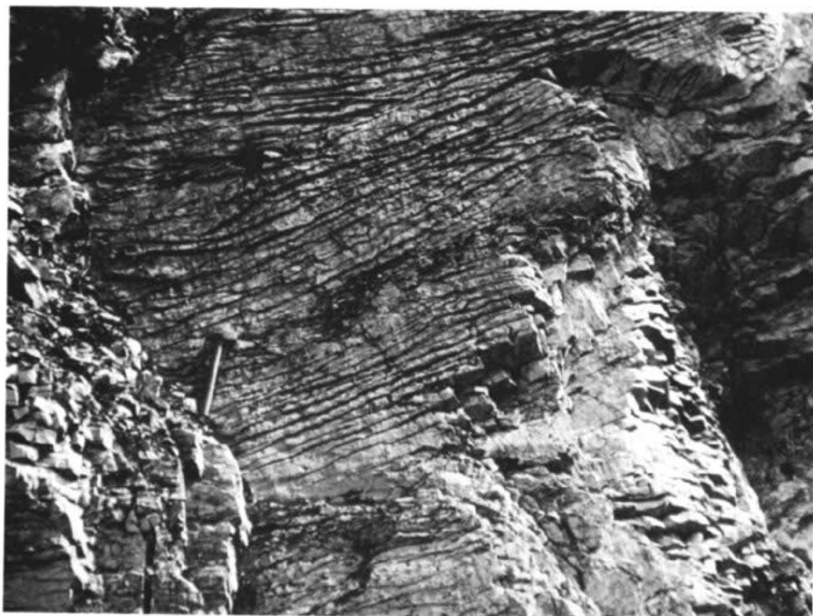
Figure 4. View of a bedding plane in the Scaglia rossa showing offset produced by dissolution along spaced cleavage surfaces. This mechanism for producing offset bedding is shown schematically by Groshong (1975a, Fig. 4B) and in Figure 5.

shown by the telescoped chert nodules in Figure 3 is about 30 percent.