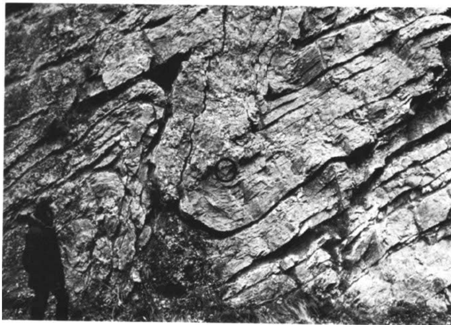
Figure 1. Parasitic fold examined in this study. Location of sample illustrated in Figure 2 is circled.

We suspect that local solubility differences in the limestone on opposite sides of the stylolite cause the serration and that these differences become less important as the much less soluble clay selvages build up, so that the surfaces become smoother. Incipient stylolites do not noticeably weaken the rock, but stylolites with thick