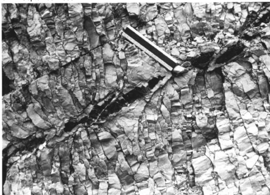
Figure 3. Spaced cleavage in Scaglia rossa dips steeply to the right in this photograph. Bedding dips gently to the left and is marked by a horizon of chert nodules with dark cores and lighter rims. Ruler is 15 cm long. Origin of the cleavage through dissolution is shown by imbrication of chert nodules and by convergence of cleavage surfaces toward points where nodules have been telescoped.

served in folded rock sequences, spaced cleavage is perhaps the least understood. There is a voluminous literature on slaty cleavage, recently summarized by Siddans (1972) and Wood (1974). This type of cleavage is manifested by the parallel alignment of phyllosilicates, and is generally thought to form perpendicular to the axis of maximum finite shortening strain.