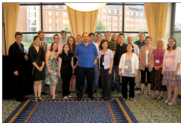
First Little Skate Genome Annotation Workshop, UD, May 2010

knowledge in hand-on exercises. The second workshop (Mount Desert Island Biological Laboratory ME, October 2010) included additional lectures on relevant topics, followed by exercises, where the eighteen participants annotated genes from the little skate transcriptome associated with the Wnt and Hedgehog signaling pathways and ABC transporters. With over forty participants, the final workshop (University of Delaware, May 2011) built upon the results of the earlier workshops with teams focusing on more complete annotation of genomic and transcriptomic genes from the Hedgehog pathway, as well as protein level annotation for a number of targets. This workshop culminated with teams presenting their annotations to the larger group and submitting appropriate information to public annotation repositories.