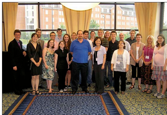
First Little Skate Genome Annotation Workshop, UD, May 2010

Three genome workshop and annotation jamborees were held in Delaware and Maine in support of the Little Skate genome-sequencing project. The goal of these four to five day workshops was expanding the base of bioinformatics-savvy researchers across the region to catalyze high-impact cyber-enabled research. Each of the workshops included participants from all five NECC states and focused on various aspects of the genome sequencing and annotation. The initial workshop (University of Delaware, May 2010) provided over thirty participants with extensive background knowledge in genomic biology, sequencing technology, and bioinformatics, and allowed them to apply this knowledge in hand-on exercises. The second workshop (Mount Desert Island Biological Laboratory ME, October 2010) included additional lectures on relevant topics, followed by exercises, where the eighteen participants annotated genes from the little skate transcriptome associated with the Wnt and Hedgehog signaling pathways and ABC transporters. With over forty participants, the final workshop (University of Delaware, May 2011) built upon the results of the earlier workshops with teams focusing on more complete annotation of genomic and transcriptomic genes from the Hedgehog pathway, as well as protein level annotation for a number of targets. This workshop culminated with teams presenting their annotations to the larger group and submitting appropriate information to public annotation repositories.