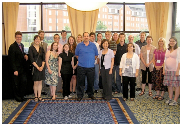
First Little Skate Genome Annotation Workshop, UD, May 2010

The second workshop (Mount Desert Island Biological Laboratory ME, October 2010) included additional lectures on relevant topics, followed by exercises, where the eighteen participants annotated genes from the little skate transcriptome associated with the Wnt and Hedgehog signaling pathways and ABC transporters. With over forty participants, the final workshop (UD, May 2011) built upon the results of the earlier workshops with teams focusing on more complete annotation of genomic and transcriptomic genes from the Hedgehog pathway, as well as protein level annotation for a number of targets. This workshop culminated with teams presenting their annotations to the larger group and submitting appropriate information to public annotation repositories. The workshop was followed by the first Annual Symposium of UD's Center for Bioinformatics and Computational Biology (CBCB) on May 27, 2011, which attracted over 110 attendees, including the participants in the weeklong genome annotation workshop. http://bioinformatics.udel.edu/seminars/ResearchSymposium