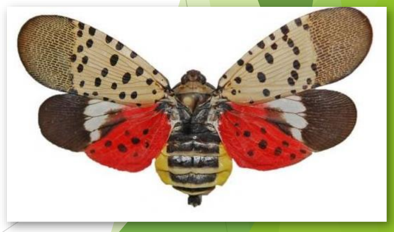
Adult – wings spread