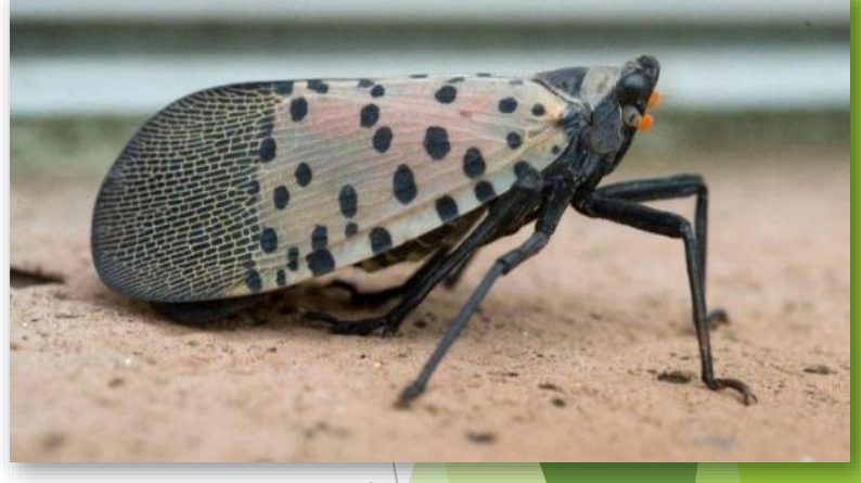
Adult – feeding position