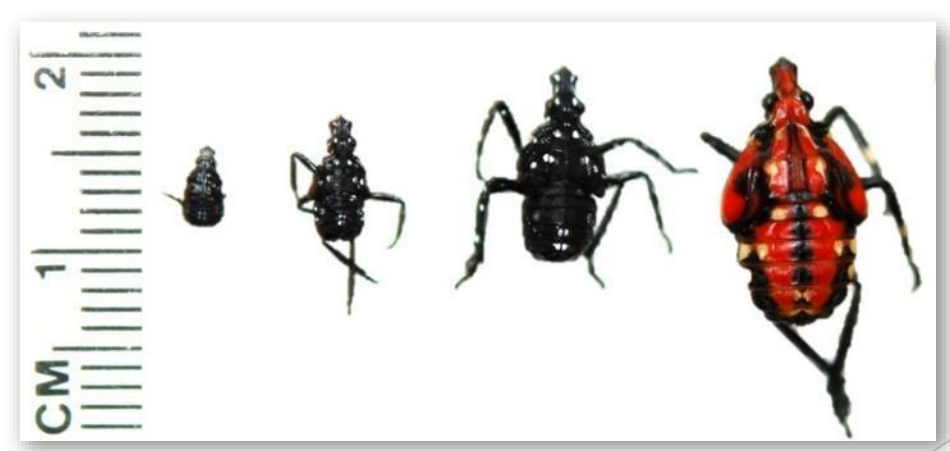
4 nymphal stages – SIMPLE METAMORPHOSIS