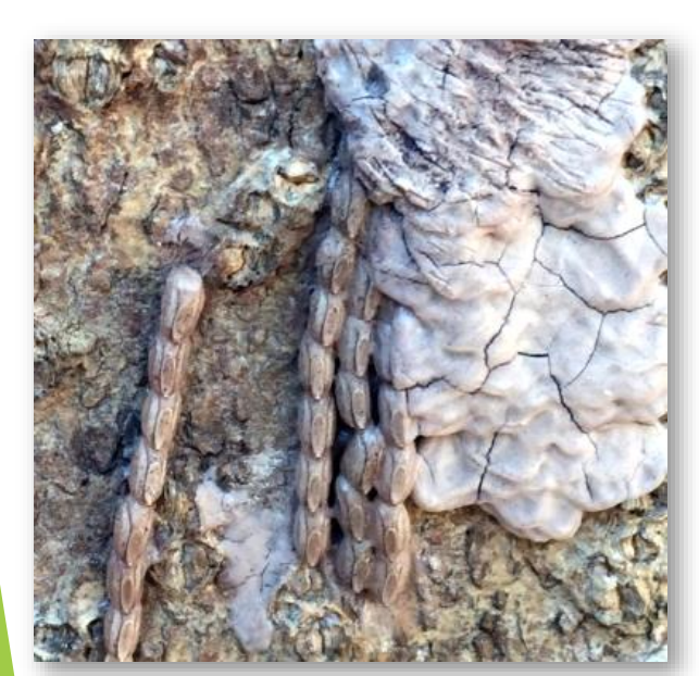
Egg mass – overwintering stage