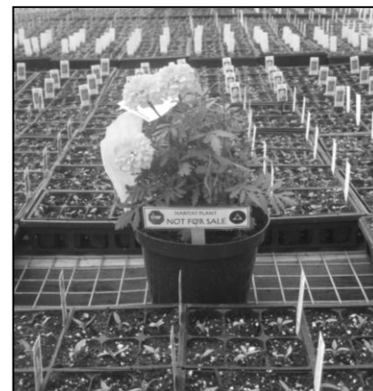
Marigold plant-mediated IPM system in commercial greenhouse.