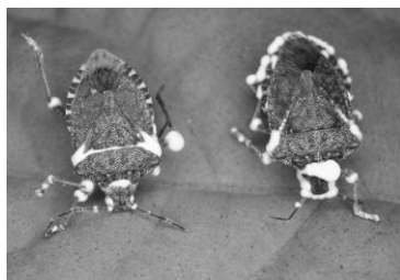
Dead BMSB with fungal outgrowth after treatment.

This is one of the latest exotic invasive pests to reach northern New England, and it is expected to have a major impact on vegetable and fruit production in the future. There have been several sightings in New Hampshire and Vermont this year. It is known to feed on over 300 plants, many of which are important food crops. Damage to crops in New Jersey and Pennsylvania this year was estimated to be in the millions. It also is a serious nuisance pest, when it enters homes in the fall in large numbers. To date, no chemical pesticide or biological control agent has been found to be particularly effective. UVM ERL scientists tested the effectiveness of the commercial insect-killing fungus Botanigard ® against the adult stage in laboratory trials. Three concentrations of the fungus were tested, and the highest rate killed 67-100% of the adults within 12 days. More research is needed to determine how best to use this microbial product under field conditions. Several other naturally-occurring insects are often mistaken for the BMSB. Collect suspect specimens and take them to your Extension specialist to confirm their identity.