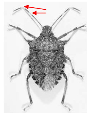
Key features of BMSB: Greyish or brown shield-shaped body, two white bands on antennae; hard shield on its back.

This is one of the latest exotic invasive pests to reach northern New England, and it is expected to have a major impact on vegetable and fruit production in the future. There have been several sightings in New Hampshire and Vermont this year. It is known to feed on over 300 plants, many of which are important food crops. Damage to crops in New Jersey and Pennsylvania this year was estimated to be in the millions. It also is a serious nuisance pest, when it enters homes in the fall in large numbers. To date, no chemical pesticide or biological control agent has been found to be particularly effective. UVM ERL scientists tested the effectiveness of the commercial insect-killing fungus Botanigard ® against the adult stage in laboratory trials. Three concentrations of the fungus were tested, and the highest rate killed 67-100% of the adults within 12 days. More research is needed to determine how best to use this microbial product under field conditions. Several other naturally-occurring insects are often mistaken for the BMSB. Collect suspect specimens and take them to your Extension specialist to confirm their identity.