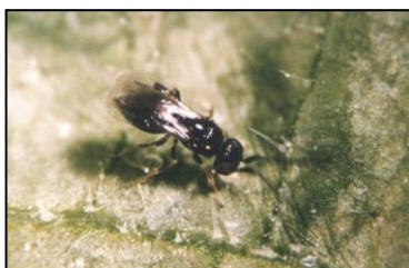
Hyperparasite of A. colemani .

Continue to start new banker plants weekly until July, following the same steps described above. Before discarding old banker plants, place under a bench for 7-10 days to let remaining parasites emerge. Keep an eye out for an infestation of hyperparasites. Hyperparasites are tiny wasps that lay an egg in the A. colemani which has parasitized an aphid. You know you have hyperparasites in your banker plants if the edge of the parasite exit hole in the aphid mummy is jagged and uneven. Hyperparasites can wipe out your A. colemani population if allowed to reproduce. Destroy any remaining aphid banker plants at the end of the season to avoid the buildup of hyperparasites. This banker plant system can be used outside in ornamental crops such as potted mums, but be sure you don't place them near other field crop plants that could be susceptible to the bird cherry oat aphid.