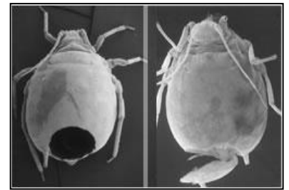
Parasite exit hole (above) from aphid mummy. Note that the hole is a perfect circle. The exit hole of a hyperparasite is jagged and has uneven edges (below).