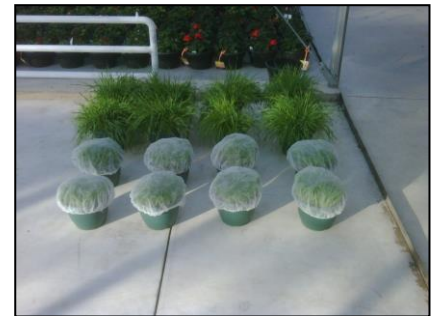
Production system for aphid banker plants. Plants from Wk 3 and 4 are covered with hairnets, Wk 1 and 2 and are uncovered to allow parasites to disperse into the crop.