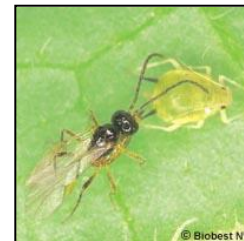
Aphidius colemani parasitizing an aphid.

2 Biobest USA, Inc. 2020 Fox Run Road, RR 4 Leamington ON N8H 3V7 CN Canada