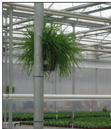
Barley banker plant that produces parasites to manage aphids.

Several species of aphids attack ornamentals, greenhouse grown vegetables and spring bedding plants. Some can be managed effectively with parasitic wasps using an Aphid Banker Plant System. Banker plants are a self-contained sustainable system that supplies a non-pest prey species to support a continual source of natural enemies that disperse into the crop in search of other pests. Essentially they are a mini-rearing system for the natural enemy. The prey may be a plant pest, but not of the crop that is being protected. For the aphid banker plant system, a cereal aphid (bird cherry oat aphid, Rhopalosiphum padi ), a cereal grass pest that doesn't attack most greenhouse bedding plants, is raised on grain plants (barley, wheat or oats). Aphidius colemani is a parasite commonly used to manage green peach aphid ( Myzus persicae ) and cotton or melon aphid ( Aphis gossypii ) and other aphid pest species found in greenhouses. This parasite can be released onto the banker plant when the population of the cereal aphid is high enough to sustain the parasite population. Over time, the parasite population will increase sufficiently so that it will disperse into your crop in search of pest aphids. The banker plant will continue to produce more