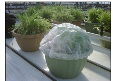
Close-up of banker plant in pot covered with hairnet.