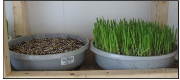
Production of aphid banker plants. Seeds spread on soil surface (left), barley 1 week after planting (right). These starter plants must be covered with a hairnet at all times.