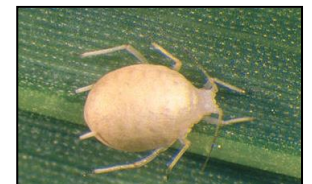
Aphid mummy. A parasite is maturing inside, which killed the aphid.