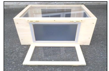
Aphid Banker Cage (Pristine Plants, LLC)