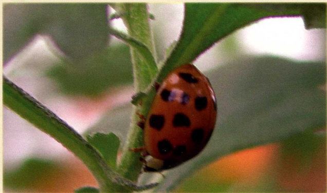
Adult ladybird beetle

Adults and larvae of the lady beetle or 'ladybug' are predators of soft-bodied insects such as aphids, scales, and mites. Adults (0.06-0.4 in long) come in various colors. There are over 500 naturally occurring species in North America. Wild lady beetles may enter greenhouses if pesticides are used selectively.