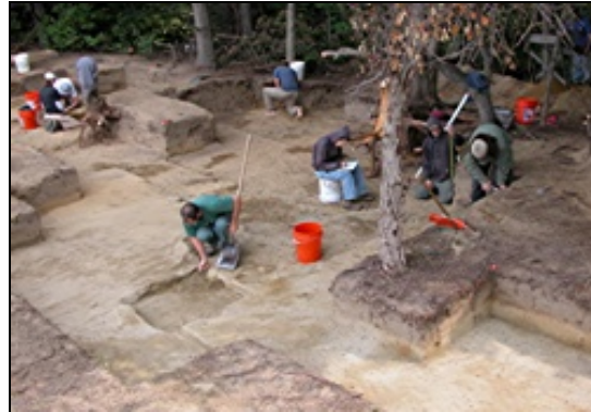
UVM consulting archaeologists unearth a crucial portion of Vermont's past at a highway site in Colchester.

For years, archaeologists were perplexed by a significant gap in Vermont prehistory. Tangible evidence proved that the region had been colonized about 10,000-11,000 years ago. But there were no signs of human habitation in what is now Vermont for roughly 1,000 years, from the end of the Early Paleoindian Period (10,000 B.P. - Before Present) and the beginning of the Early Archaic period (9,000-7,500 B.P.) Yet reasons