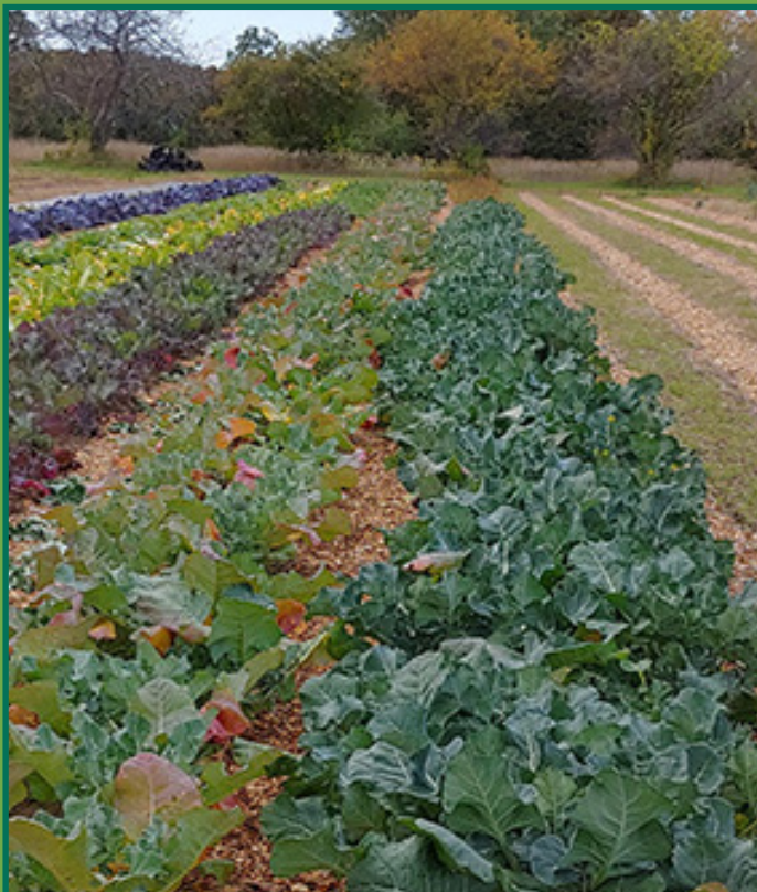
The row on the right was grown with wool pellets at the UVM Catamount Farm during the 2019 field trials. The control row is on the left.