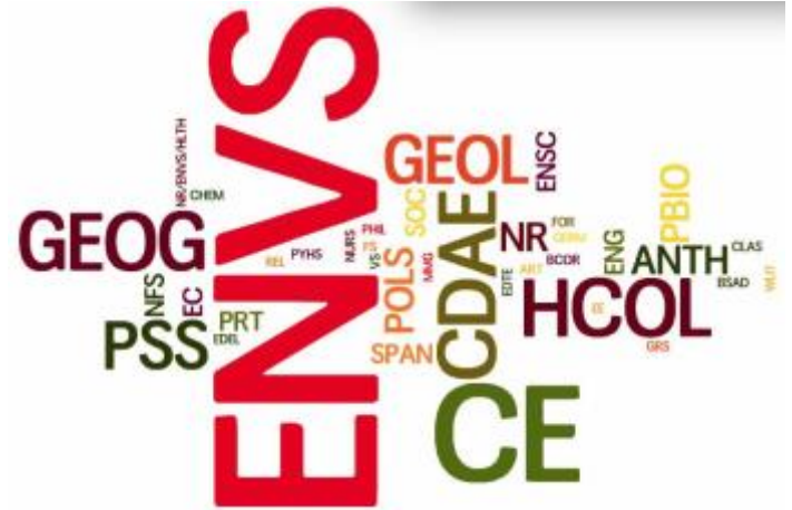
Fig 2: Word cloud of degree programs with SU courses (largest font = most SU courses)

Report submitted by Laura Hill (co-Chair) and Deane Wang (co-Chair), SCRC