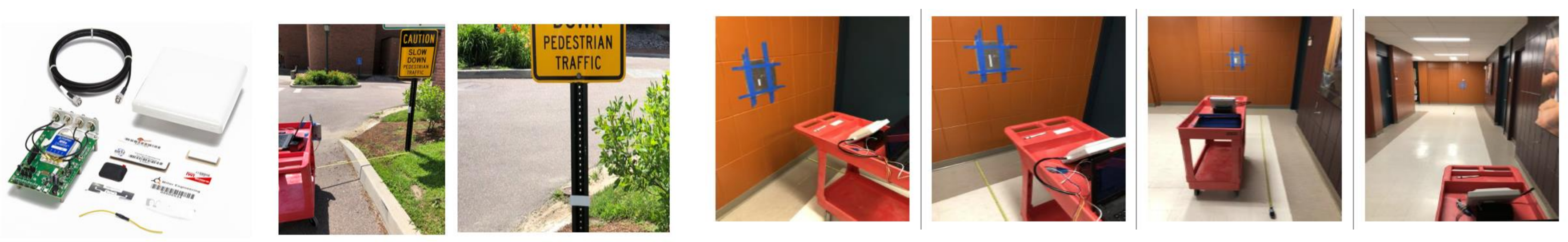
Figure 2. Laboratory setup for preliminary experimental study

A commercial mobile RFID reader and a set of passive RFID tags were adopted in an experimental study. The experiments showed promising results where RFID tags could be remotely scanned in a moving cart.