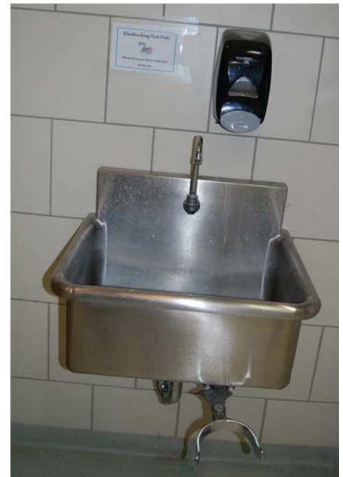
An example of a hand washing sink with proper signs reminding workers to wash hands after contact with any contaminants.