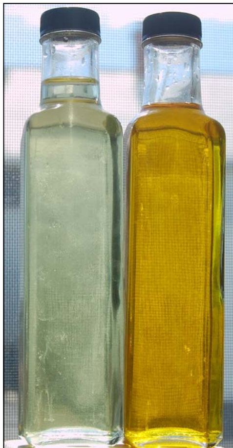
Figure 5: Bleached canola oil (left) and un-bleached canola oil (right) are very different in color due to the natural colorants removed during bleaching.

steaming the oil, which vaporizes the unwanted components and separates them from the desired material. For the small-scale or local producer, this process may not be desired, for several reasons. Deodorizing removes flavor and odors which are often prized in oils, enhancing the flavor of the foods they are used to prepare. Also, this process requires additional equipment which can be costly to purchase and maintain.