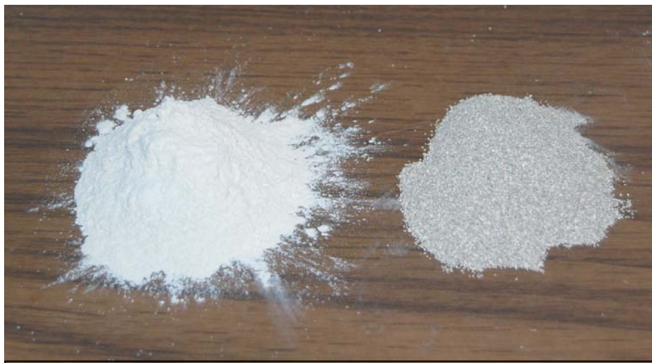
Figure 4: Two different types of bleaching clay. Shown on the left is a sample that is mixed with the oil, heated, and put through a filter press. On the right is a sample that is used as a filter in itself, which the oil is passed through. In both cases, the unwanted components in the oil are bonded with the clay, removing them.

nents that increase the rate of oxidation. When oil is used at high temperatures, for example when pan frying or deep-fat frying, oxidation is accelerated and the oil may develop undesirable characteristics such as off flavor or dark color quickly. Bleaching allows the oil to be used for a longer period of time before these undesirable characteristics occur.