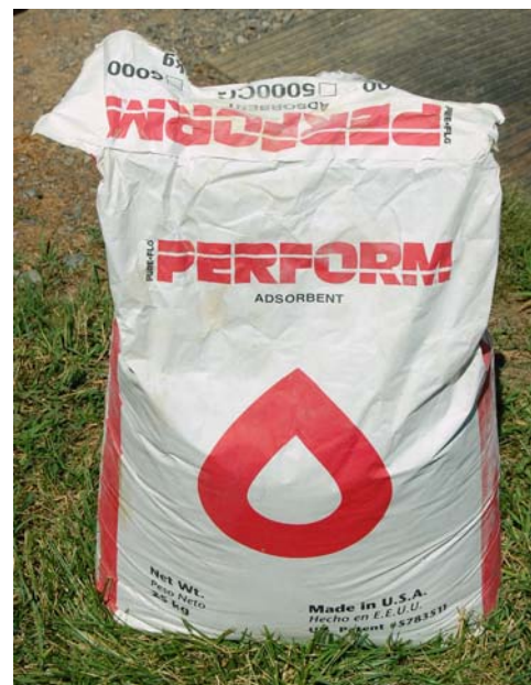
Figure 3: A bag of bleaching clay.

acid, 98% oil. The acid is composed of a solution of 30% acid with 70% water. This total mixture is kept at 80° C for up to 15 minutes, then rapidly cooled, settled, and separated via centrifuge. Commercial operations may include additional processes in the refining stage.