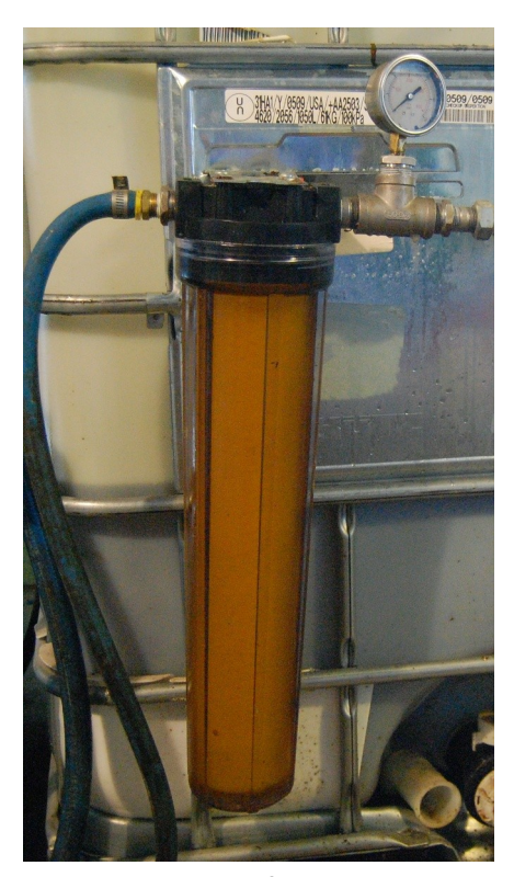
Fig 6: Cartridge filter with clear housing used as final filter for fueling with straight vegetable oil

Where a bag filter has only one layer of filtering material, a cartridge filter (Fig. 5) is a depth filter, meaning that the filtered fluid must make its way through many layers of filtering