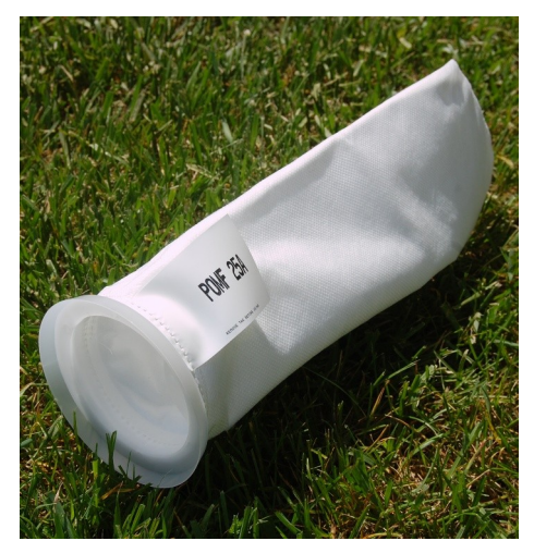
Fig. 4: Bag filter without housing