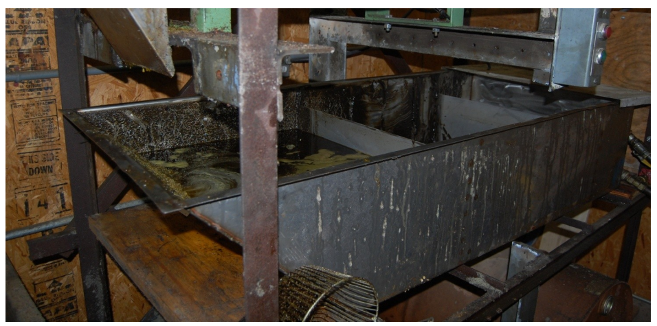
In this tank pressed oil flows slowly from left to right. The oil passes across two partitions, allowing particles time to settle. Most of the settling occurs within the first partition.