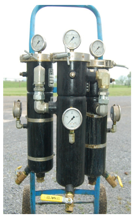
Fig. 3: Three bag filters and housings arranged in series.

filter. For example, many filter catalogs refer to a nominal rating or an efficiency rating for their filters. Often filter ratings are referred to as a "nominal" rating, meaning the filter will remove most, but not all, of the particles over a particular size. An "absolute" rating of a filter means that the filter will remove all of the particles above a particular size. One example is a manufacturer that rates its filters as 80% efficient, meaning that a 15 micron rating captures at