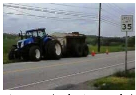
Fig. 1: Result of using SVO fuel without reliable filtering.

As oilseeds are pressed to separate the oil and meal, particles of the crushed seed are also carried into the oil. While the pressing operation can be modified to reduce the amount of particles in the oil, some cleaning of the oil will be needed to remove these potentially unwanted particles. If used for fuel, particles are nuisances as they clog fuel filters and stop the flow of fuel to the engine (Fig. 1). As an edible oil, some operators believe that particles in the oil show that the oil is "natural" or locally produced. Other edible oil producers believe that the product match "store should bought"