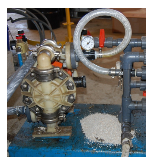
Fig. 9: Air operated diaphragm pump on filter press