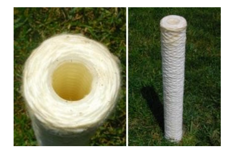
Fig. 5: End (left) and full (right) view of wound cartridge filter

Where a bag filter has only one layer of filtering material, a cartridge filter (Fig. 5) is a depth filter, meaning that the filtered fluid must make its way through many layers of filtering