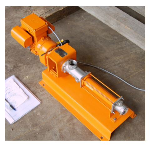
Fig 10: Electric screw pump for filter press

Another setup uses an electrically driven screw pump (Fig. 10) with a pressure switch and accumulator. The pump runs and builds pressure in the accumulator to a high point, then a pressure switch turns the pump off. Pressure in the accumulator and oil being filtered slowly falls off as clean oil is pushed through the filter plate. When a low pressure is reached, a pressure switch turns on the electric