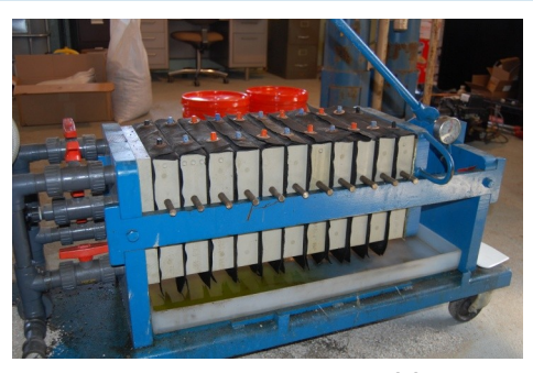
Fig 7: Filter press; a series of filtering plates are pressed together by manual screw or hydraulic pressure.

the filter. Again, manufacturers will give guidelines of how high the pressure is allowed to get before changing out the cartridge.