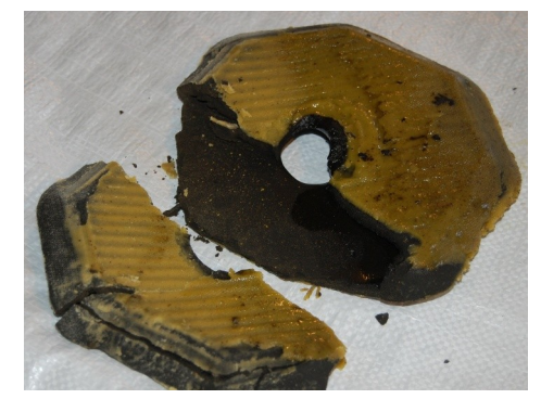
Fig. 8: Block of foots collected from between two filter press plates. The yellowish colored material is filtering media coating (diatomaceous earth) initially placed on filter plate cloth while the dark colored materials are the foots

To prepare the filter press for filtering, a mixture of clean vegetable oil and the filter media (a very fine material that acts as the filter) is pumped quickly into the stack of plates that are pressed tightly together. This mixture of oil and media deposits the media onto the face of the cloth covered plates as the oil passes through, creating a buildup about 1/16 of an inch thick