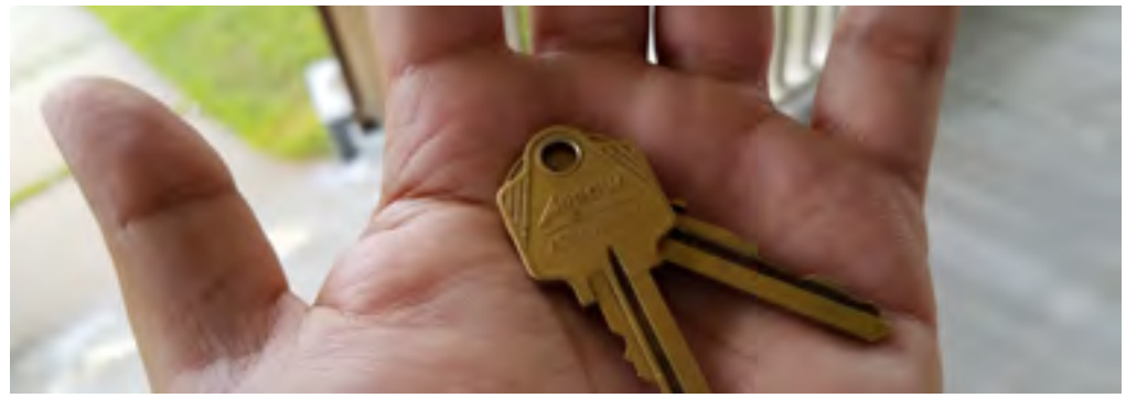
Make sure to ask for a "core lock change".

Follow these tips when signing your lease: