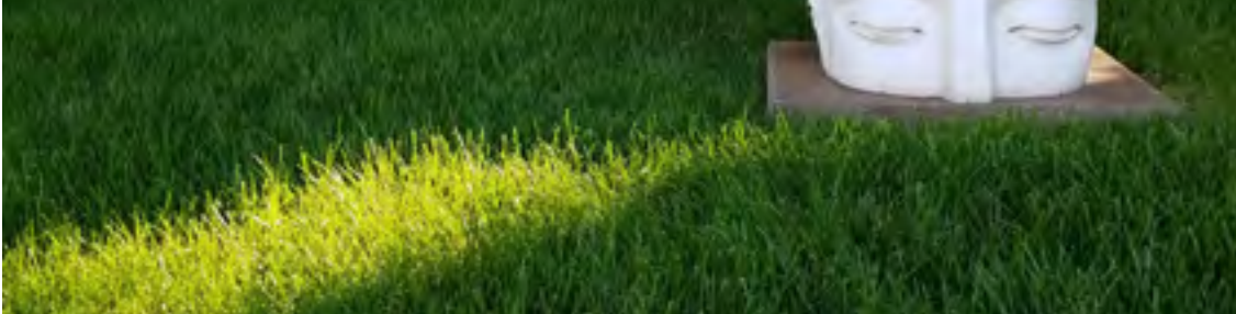
Consider the following tips for making your life off campus safe and healthy.

When living on campus, you had a variety of services that kept you safe and healthy. While some of those - like healthcare providers - are still available to you, there are some important systems that are not. In specific, managing fire and property safety for your household will now be your responsibility.