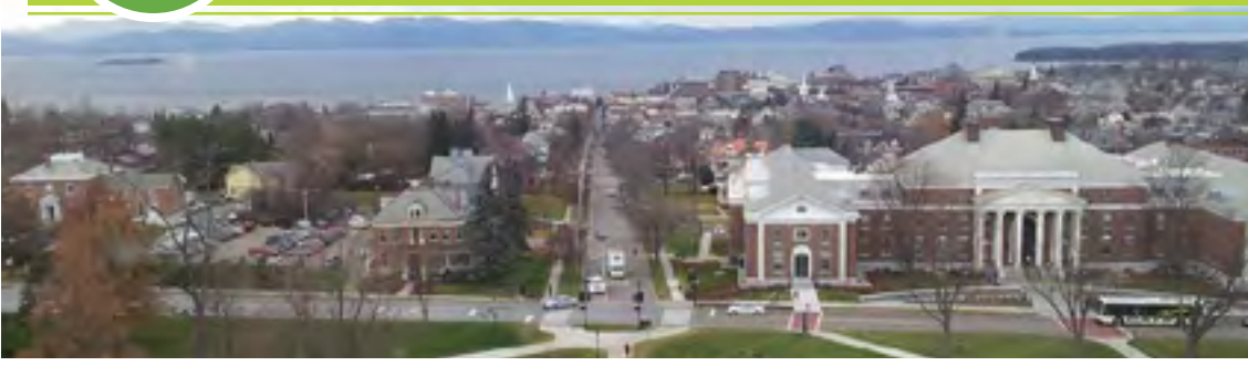
View of the City of Burlington from the belfry of Old Mill.