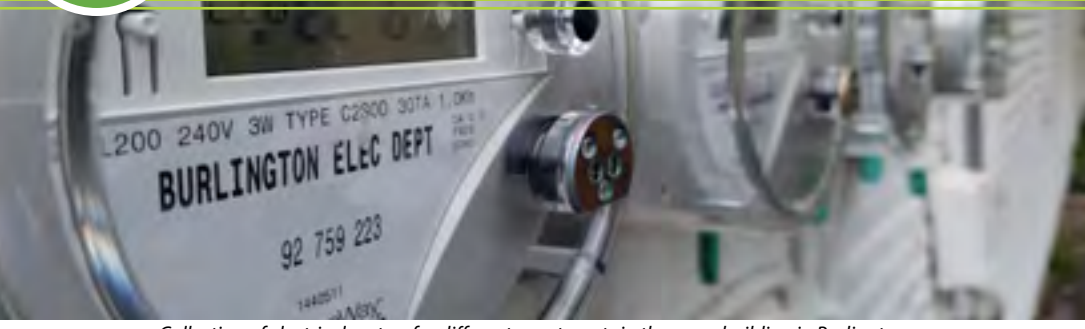
Collection of electrical meters for different apartments in the same building in Burlington.

here are a lot of moving parts to setting up your home, even after you have lined up roommates, found a place, signed a lease and moved in. This includes starting up utilities, being clear on your recycling and trash schedule, and even thinking about how to conserve energy.