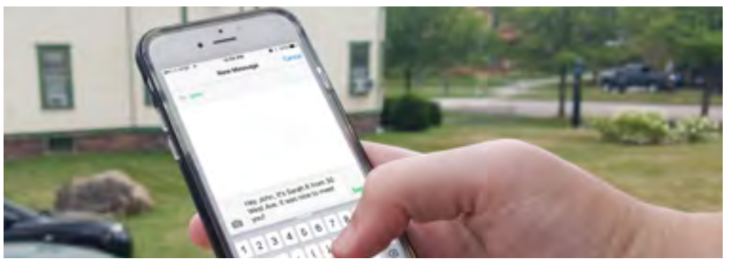
Developing positive relations with neighbors takes effort but is a win-win situation.

Burlington's neighborhoods are diverse and each street has its own character. After you move in and get settled, get to know your neighborhood.