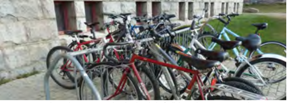
Remember to always secure your bicycle. A bicycle thief will choose the easiest one to steal..

Burlington city ordinance prohibits grills and barbeques from being used on porches. Use grills and other cooking equipment at least 15 feet away from the residence or any structure.