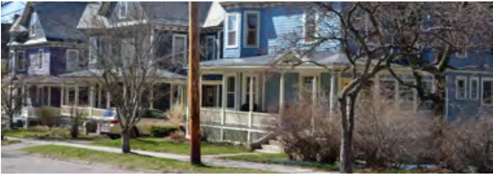
Late night noise is one of the top quality-of-life complaints in Burlington. It affects everyone equally.

Burlington's neighborhoods are a mix of families, students, senior citizens and working people. Noise at night has an impact on the entire neighborhood. Be mindful of your noise level at all times.