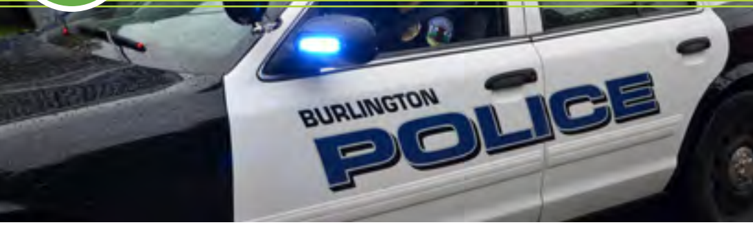
Be mindful of how your actions can have an impact on yourself, your friends, and your community.