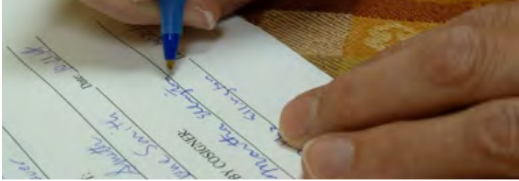
Co-signers are almost universally required by landlords for first-time renters.

Before you rent, make sure you know the following: