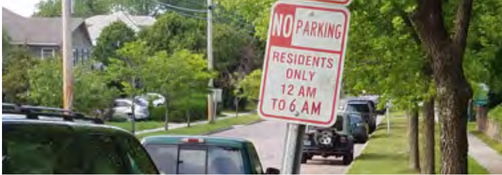
Pay attention to signage to make sure you avoid parking fines which can be as much as $125

Some streets in Burlington are posted as residential parking only. You must have a valid parking permit, or a guest pass to park on these streets. In order to obtain a residential parking permit, contact the Burlington Police Parking Enforcement Division .