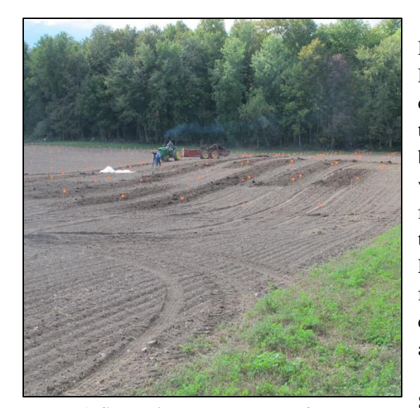
Image 1. Spreading manure to the fall applied manure plots, Alburgh, VT.

Plots were harvested with an Almaco SPC50 plot combine on 19-Jul 2013; the harvest area was 5' x 30'. At the time of harvest, grain moisture, test weight, and plot yields were measured.