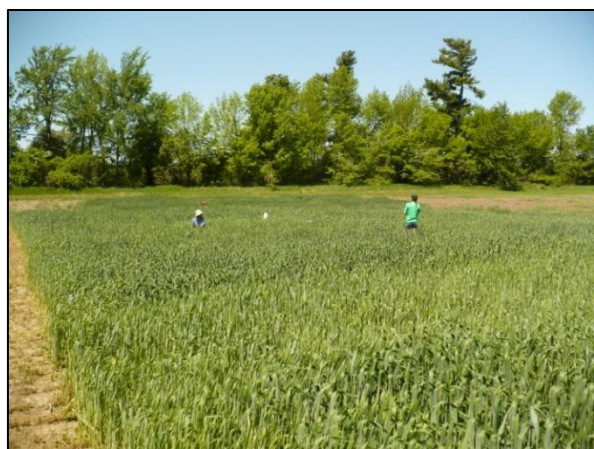
Image 1. Plant and soil sampling, Alburgh, VT.

Plots were sampled for soil nitrates and plant nitrogen concentration prior to organic N applications and at key developmental stages until the wheat reached physiological maturity (Image 1). From each plot a composite of 10 soil cores (1 inch dia., 12 inch depth) was taken, placed on ice, and transported to the testing laboratory on the day of sampling. Soil nitrates were measured using flow injection analysis. Plant samples were taken to determine total nitrogen concentration by combustion analysis at the same time as soil sampling. The tissue samples consisted of 4 rows of wheat top growth, 12 inches in length selected randomly within each plot. Samples were put into clean paper bags, placed on ice, and transported directly to the laboratory for analysis. All soil was analyzed at