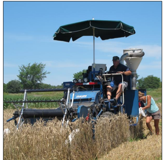
Image 2. Winter wheat N topdress trial harvest, Alburgh, VT.

The treatments differed significantly in yield (Table 4; Figure 1). The highest yielding treatment was 70lbs ac -1 of Chilean Nitrate applied at spring greenup (GS25) with 3845lbs ac -1 . The unamended control treatment (2244lbs ac -1 ) yielded less than Chilean Nitrate treatments applied at GS30 GS25 at the 70 and 35 lbs ac -1 . Interestingly, there were no significant differences in grain moisture and test weight. The treatments differed in protein concentration (Table 4; Figure 2). ‘Pro-Booster’ treatments and Chilean Nitrate applied at both GS25& GS30 stages had the highest protein levels. Fall manure applications and the unamended control treatments did not differ in CP concentrations. Interestingly, the protein level of ‘Chilean Nitrate’ applied at GS25 was not significantly different than the fall applied manure or the unamended control plots. The average protein level was 11.5%. Treatments did not differ significantly in falling number or DON.