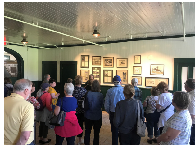
First tour of the 2019 season, viewing the heritage exhibit in the newly renovated lobby.

Thanks to the Manton Foundation's pivotal grant award in 2018, the main barn visitor area has received much-needed renovation. The two bathrooms are now ADA compliant, the lobby has a new heritage exhibit and a spectacular fresh coat of paint, and the gift shop has expanded into the movie room. Not readily visible but critically important was the installation of smoke detectors and emergency lighting. The next phase of work will focus on Main Barn roof & cupola repairs, and ceiling repairs in the lower level. Stay tuned for more updates.