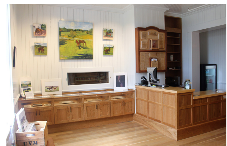
Newly renovated gift shop.