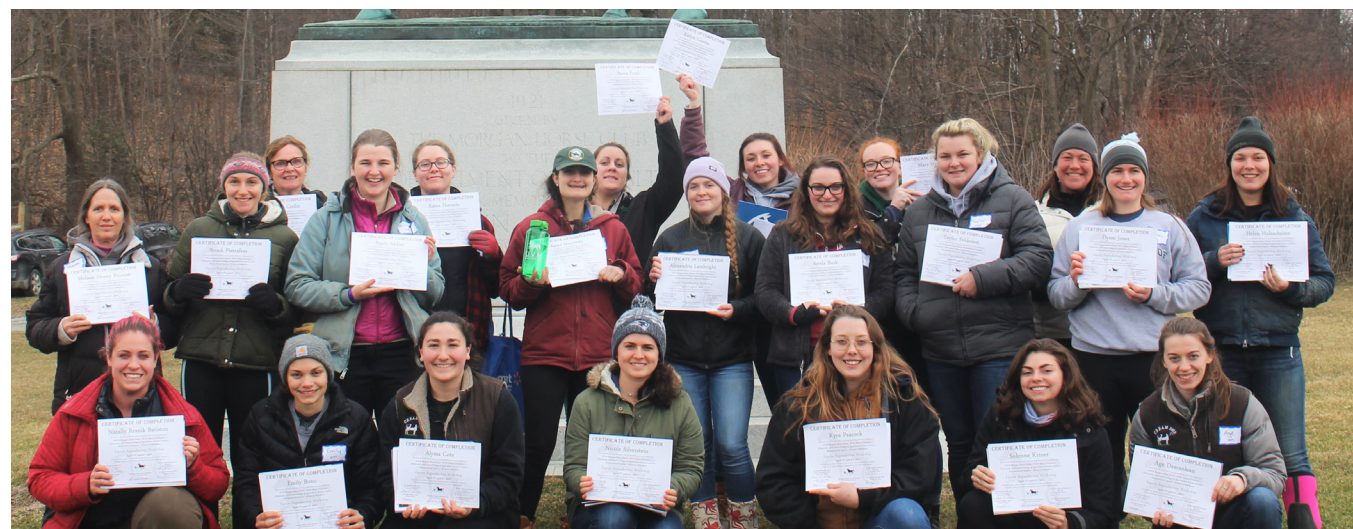
2019 Equine Reproduction Workshop was a success with UVM & VTC students, in addition to several "civilian" horse owners from the public.