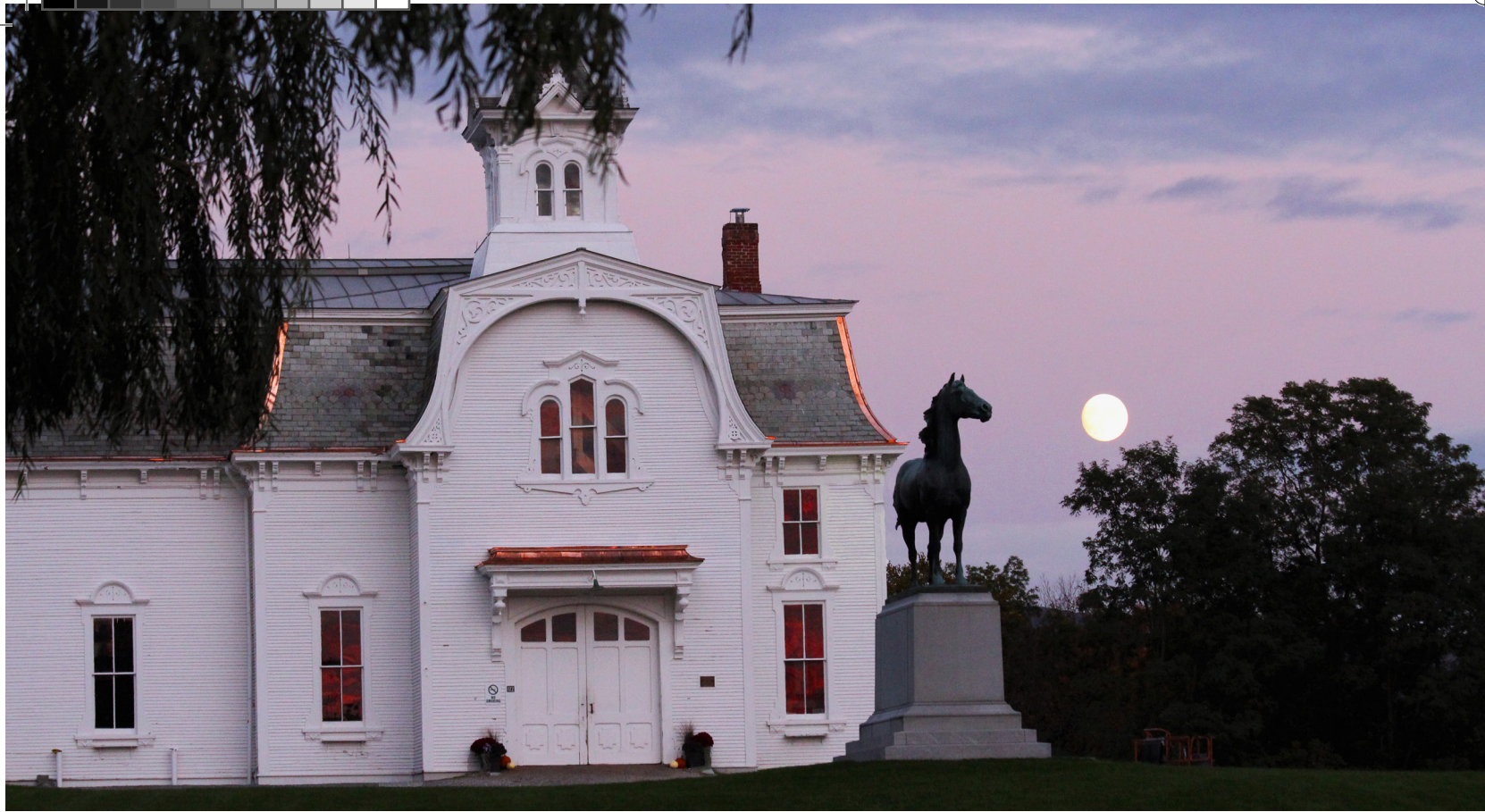
Full moon rising behind main barn; vivid pink sunset reflected on windows and new copper flashing.

Thanks to the support and impressive collaboration of several Vermont programs, the historic Remount Barn, (used to house mares and foals), received a breathtaking makeover. The University of Vermont funded new siding and badly-needed window & door repairs. The Vermont Agency of Agriculture coordinated with Department of Labor to employ individuals from the Youthworks Program, who developed job training experience of painting the barn with white stain donated by The Pizzagalli Foundation.