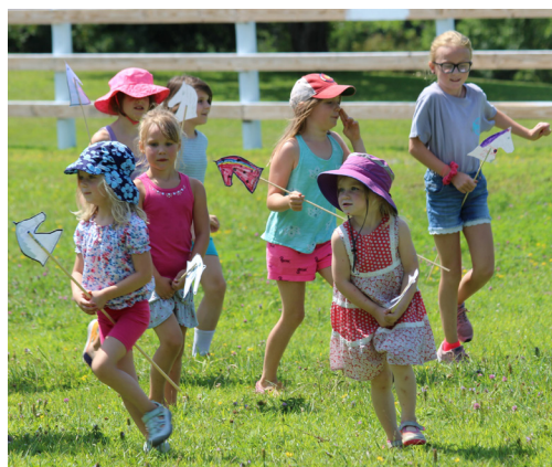
A new event for Vermont Day this year- the stick horse judging competition- a huge hit!

Summer 2019 included two successful short-term internships for two students; one from the Royal Veterinary College of London, U.K. This will be repeated in summer 2020 with an almost full roster of summer interns from Michigan State University, Cornell, University of New Hampshire, and of course UVM.