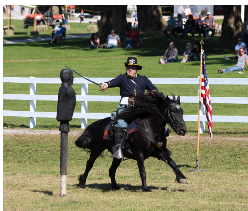
Full charge "running at the head" mounted saber drill on Cavalry Day.