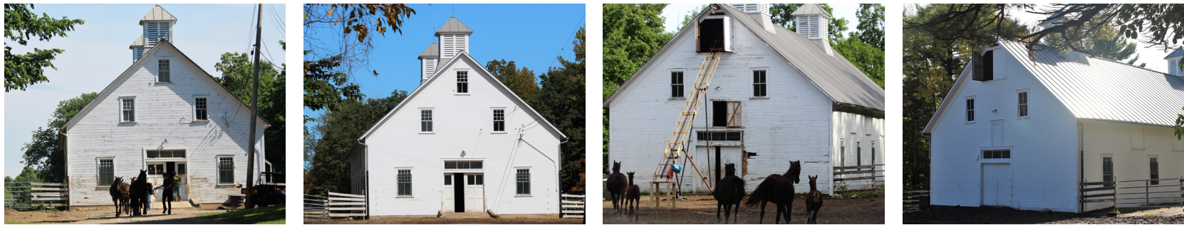
Remount Barn before and after photos.

In 2019, the number of people visiting the farm increased 11% from the previous year, despite the delay of Opening Day due to construction, (May 23rd). Tourism revenue for the farm, overall was up 14%. The recently renovated physical space and positive press received through Yankee Magazine, Vermont Magazine, and The Morgan Horse Magazine all attributed to this year's successes.