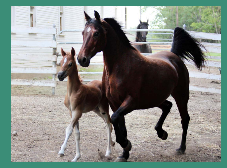
UVM Madeline with her adopted filly by UVM Equity and out of Gradells Fair Lady. This situation was a unique learning experience for the students. With veterinary consultation, UVM Madeline was brought into milk via hormone treatments and successfully accepted the foal as her own.

The farm welcomed two fillies this spring. UVM Freya had a big bay filly by UVM Abington. UVM Madeline was an adopted mother to a fancy chestnut filly by UVM Equity and out of Gradell's Fair Lady. Seven mares are in foal for spring 2021, the first due mid-March. Several UVM Morgans found new owners this year and we are excited for these developing partnerships. Welcome to the #myUVMMorgan family!