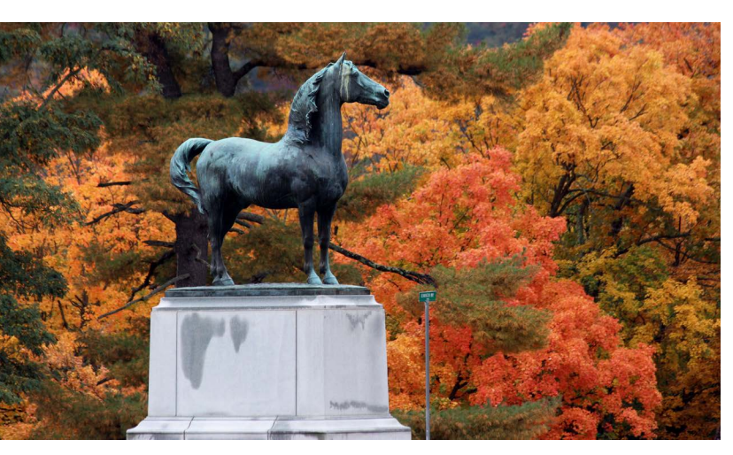
The statue of Figure with brilliant fall colors. The statue turns 100 years old in 2021- stay tuned for details on how the farm plans to celebrate this important milestone