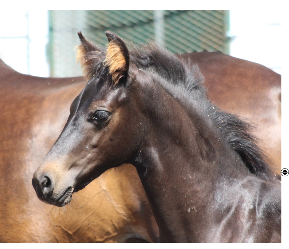
The 2021 Raffle Colt is a handsome bay with two white hind socks, UVM Dover, (UVM Willoughby x UVM Halcyon). Visit the

Summer is here and so are the tourists! Navigating COVID-19 meant a late start to the season with reduced capacities and online pre-registration. Thanks to Vermont's stellar vaccination rollout, beginning in July guests are able to visit the farm Monday-Saturday as they have in past, no face-coverings required with current COVID-19 vaccination. The early season numbers have been strong, likely thanks to several promotional opportunities this summer. The July issue of Horse Illustrated Magazine and the July-August issue of Equestrian Living Magazine both featured the UVM Morgan Horse Farm. A film crew has been a the Morgan Horse Farm this year to capture footage for a future documentary on PBS- more details coming this fall!