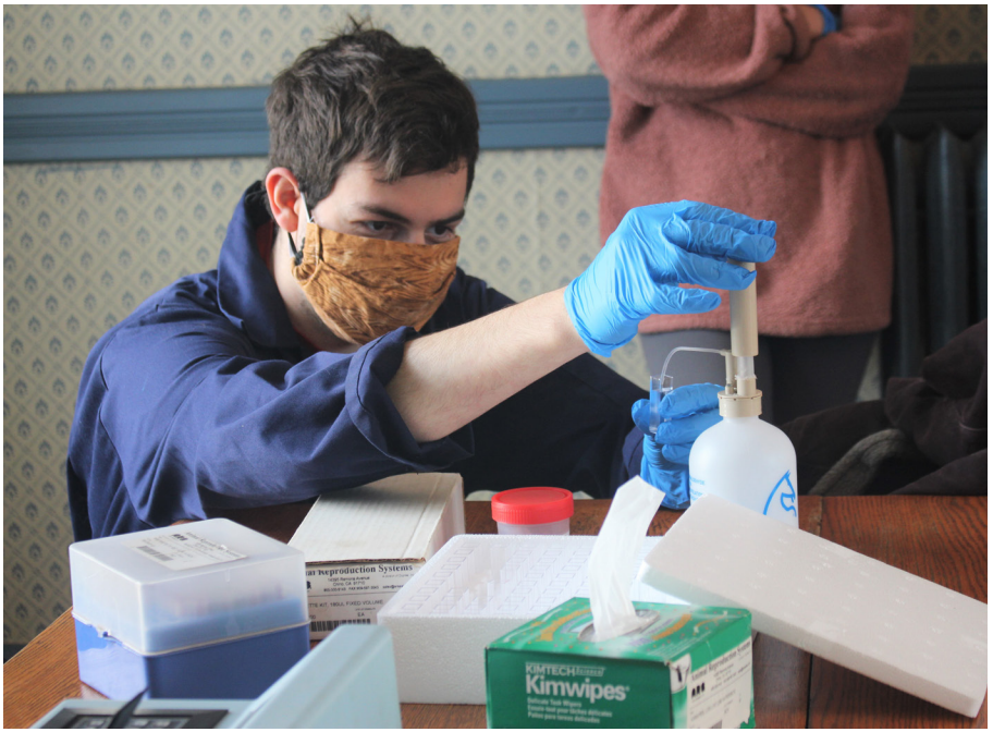
Reproduction Workshop to further his skills and experience on his