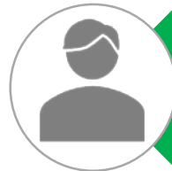
TBD RSENR: Proposal Developer