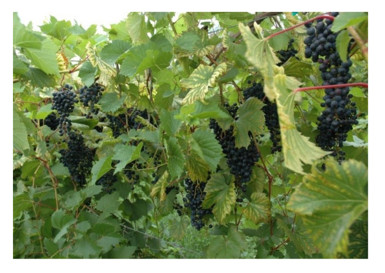
Figure 2: Ripening is substantially improved when grapevines are wellmanaged. These Frontenac clusters were well-exposed to sunlight by appropriate shoot positioning and leaf pulling performed in early-mid July.

Figure 1: A simple and effective juice field lab can be set up on a bench in the shop, or even on a truck tailgate. Pictured here are (counter clockwise, beginning at lower left): bagged grapes for squeezing; a refractometer for measuring sugars; a pH meter; and a titrator for dispensing NaOH.