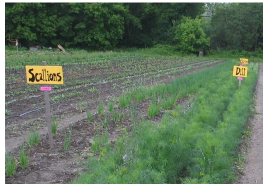
PYO beds of herbs

The best ways to maximize physical distancing during PYO is to limit the number, frequency, and proximity of people on the farm. Therefore, farms should weigh the pros and cons of PYO and strongly consider alternative markets for their crops when possible. A poorly planned PYO could result in the exposure of you, your staff and your customers. Consider whether it is worth the risk and if you have a back-up plan if you or your workers were to get sick. If you decide to go ahead with PYO, your operations must be modified in ways that maximize social distancing.