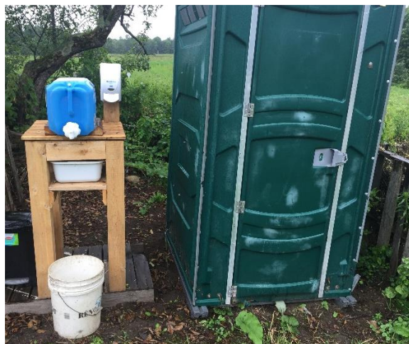
Handwashing and toilet facilities are "high touch"