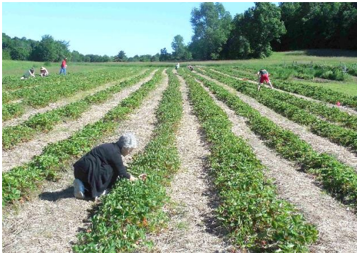
PYO strawberry field