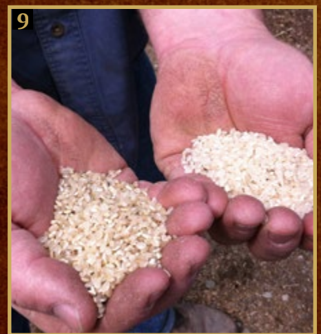
Step-by-Step rice production with the New Farms for New Americans' rice project (New Farms for New Americans)