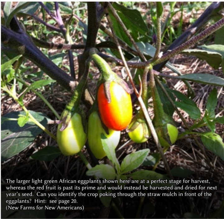
The larger light green African eggplants shown here are at a perfect stage for harvest, whereas the red fruit is past its prime and would instead be harvested and dried for next year's seed. Can you identify the crop poking through the straw mulch in front of the eggplants? Hint: see page 20. (New Farms for New Americans)

Cultivation technique is similar to purple eggplants. Plants benefit from being started about 8 weeks before outplanting in the field. Like most solanaceous plants, African eggplant likes a warm soil and is a heavy nitrogen feeder. Black plastic or road fabric used as mulch was found to boost yield in preliminary University of Vermont Extension trials done in Burlington, Vermont, likely due to reduced weed pressure and warmer soil temps. The key difference between cultivating African eggplant and its smaller cousins is the plant spacing. African eggplant needs at least three feet between plants to reach its full potential.