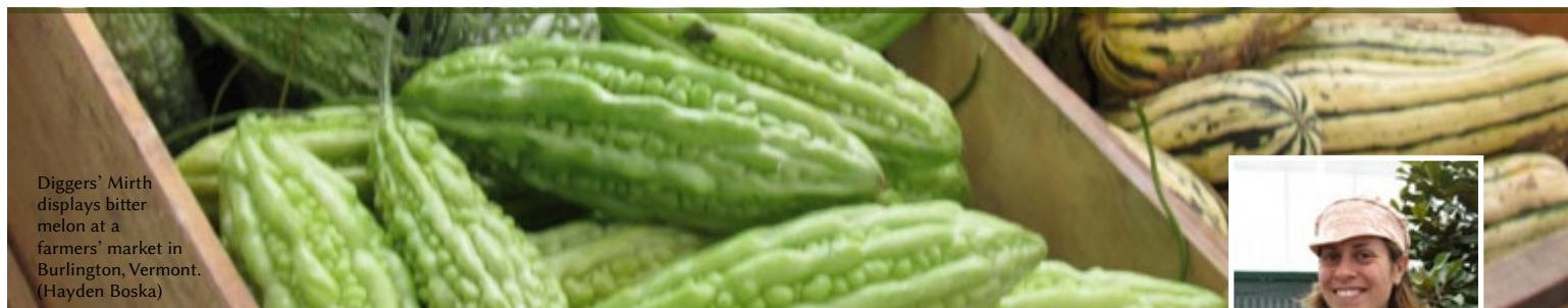
Diggers' Mirth displays bitter melon at a farmers' market in Burlington, Vermont. (Hayden Boska)