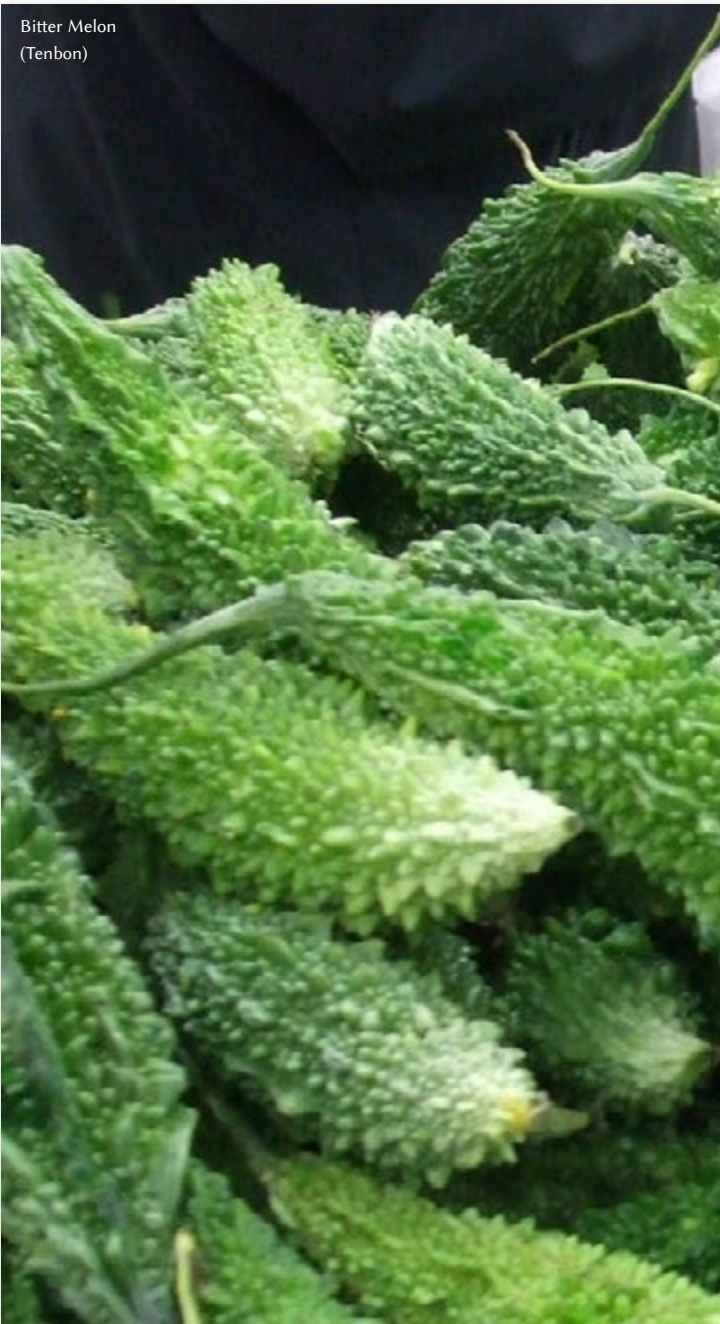
Bitter Melon (Tenbon)