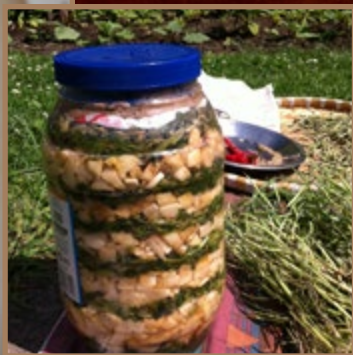
Step 6: White roots and leaves combined into one container (New Farms for New Americans)