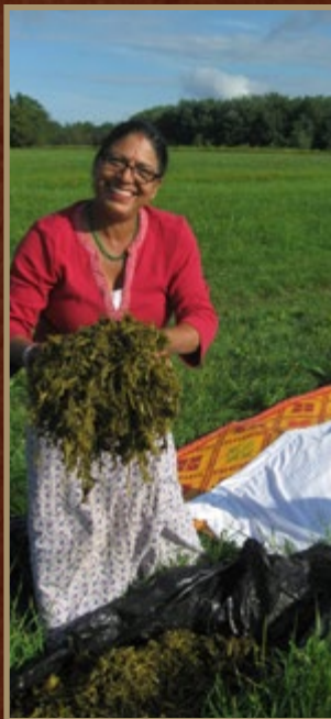
(New Farms for New Americans)

For more information, visit www.aalv-vt.org