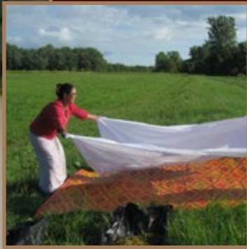
Step 2: Bhutanese farmers lay a sheet on the ground for drying daikon (New Farms for New Americans)

How do you know it's harvest time down by the fields of Bhutanese farmers and gardeners? On sunny days you'll see bustling activity of people spreading out tarps, laying out leaves and white root pieces, and bringing them in before sun down. Many cultures throughout the world dry and ferment daikon and mustard greens in order to preserve them for healthy eating throughout the winter. Here is the Bhutanese way: