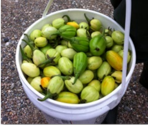
A bucket of African eggplants ready for sale at the market (New Farms for New Americans)

from chilling injury. Storage should have high relative humidity (90-95%). If you are not able to regulate humidity, fruits can be stored in perforated plastic wrap, plastic bags or waxed cartons to maintain high humidity. To extend the storage season, fruits can be sliced and blanched for 3 minutes in boiling water, cooled rapidly in ice water, patted dry and frozen in air tight freezer bags.