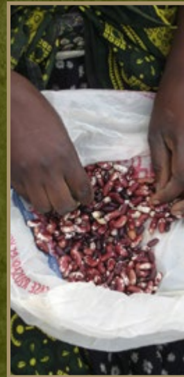
(New Farms for New Americans)