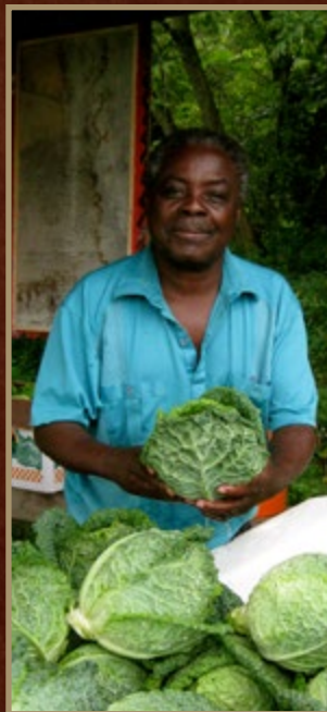
(New Farms for New Americans)