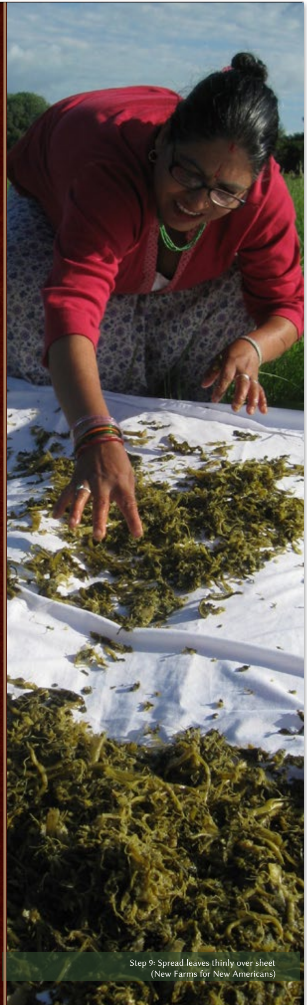
Step 9: Spread leaves thinly over sheet (New Farms for New Americans)