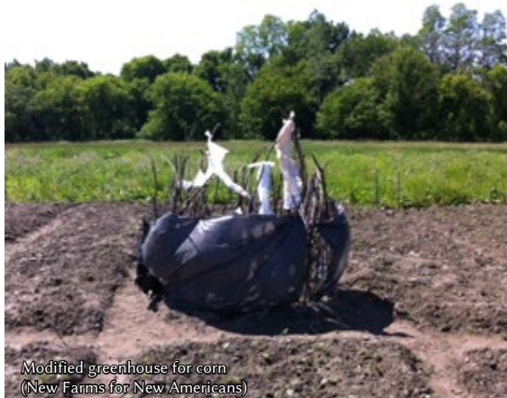
Modified greenhouse for corn (New Farms for New Americans)

Farmers sometimes make modified greenhouse spaces to start their corn. After several weeks the seedlings are dug up and transplanted into the field.