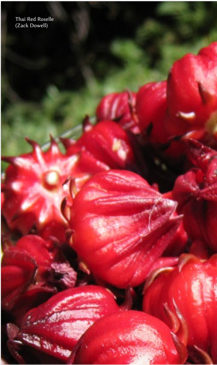
Thai Red Roselle (Zack Dowell)

“Roselle grows everywhere and anyone can grow it, it’s as easy as cutting a stem and putting it in the ground. We eat it year round and believe that it cleanses our body. Eating it is like an overhaul of our body’s system.”