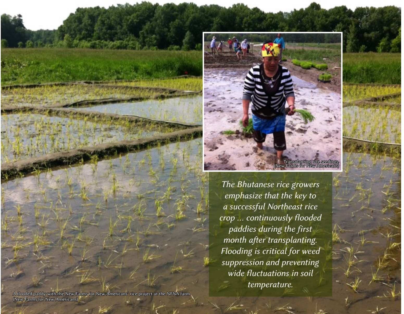
Transplanting rice seedlings. (New Farms for New Americans)

The Bhutanese rice growers emphasize that the key to a successful Northeast rice crop is a healthy early start for seedlings in the greenhouse and continuously flooded paddies during the first month after transplanting. Flooding is critical for weed suppression and preventing wide fluctuations in soil temperature. Flooding can be reduced to twice a week once rice is well established or in tillering (seeding) stage. See pages 10 through 11 for a photo how-to on growing rice in the Northeast.