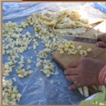
Step 5: Slicing the white roots into one inch cubes (New Farms for New Americans)