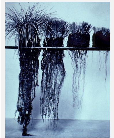
Figure 2: Demonstration of different grazing levels in the root development which directly relates to soil quality.