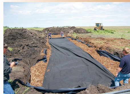
Figure 6. Covering the woodchips with a geo-textile fabric before laying the soil cover at a bioreactor installation

A bioreactor's annual nitrate load reduction can range from about 10 percent to greater than 90 percent depending on the bioreactor, the drainage system, and the weather patterns for a given year. Based on research from Iowa, Illinois, and Minnesota, most bioreactors show performance of about 15 to 60 percent nitrate load removed per year. It may be best to target fields or watersheds that have higher nitrate loads in order to have the biggest impact.