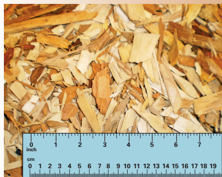
Figure 2. Woodchips commonly used in woodchip bioreactors