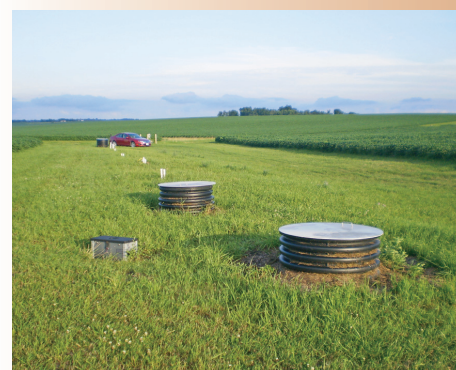
Figure 7. Woodchip bioreactor after installation; circular sumps and PVC wells used for research monitoring (Northeast Iowa Research and Demonstration Farm)