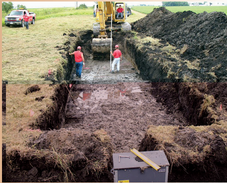
Figure 4. Excavation for a bioreactor installation