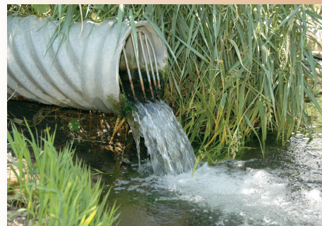
Figure 1. Subsurface tile drain outlet