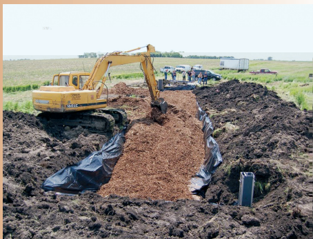
Figure 5. Filling an excavation with woodchips for a bioreactor installation

Providing these denitrifiers an ample supply of carbon to eat and giving them anaerobic conditions in the bioreactor offers them a perfect environment to remove nitrate from drainage.