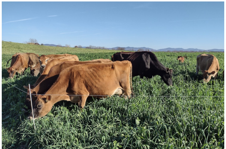
Severy Farm's grass-fed cows grazing fall annual forages.

Severy Farm is a certified organic grass-fed dairy farm located in Cornwall, VT. This dairy farm has been in operation for almost 50 years and certified grass-fed for approximately 2.5 years. The herd is composed of approximately 60 crossbred dairy cattle that calve year-round. The average daily milk production for the herd with TAD milking was 31.3 lbs/cow which is slightly higher than the 30.5 lbs/cow national average for grass-fed dairy (Snider et al., 2019).