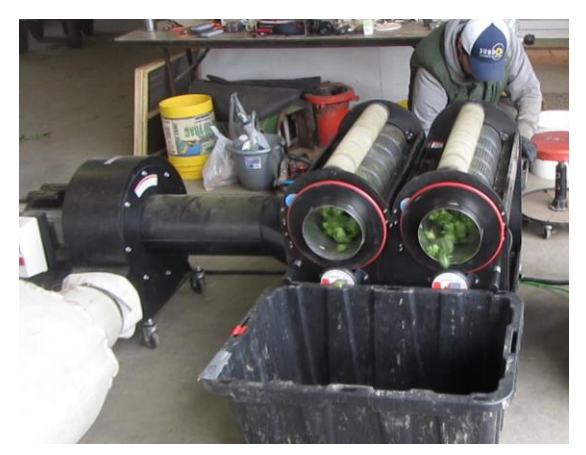
Image 1. Centurion Pro Gladiator Trimmer (Maple Ridge, BC, Canada).

Harvested plants were separated into individual branches and stripped of its fan leaves. Flowers were separated from individual branches using a BuckmasterPro bucker (Maple Ridge, BC, Canada) in Vermont. Bucked flower was then fed through the Centurion Pro Gladiator Trimmer (Maple Ridge, BC, Canada) (Image 1). Wet bud weight and unmarketable bud weight were recorded. Stems were also collected and weighed. Flower dry matter content was assessed by collecting a flower subsample and drying the flower sample overnight in a small dehydrator. A subsample of flower was taken and sent to ProVerde Laboratories in Portland, ME for cannabinoid analysis. The percent moisture at harvest was used to calculate total dry matter and flower dry matter yields. Samples for whole plant nutrient analysis and leaf nitrogen measurements were sent to DairyOne Laboratories in (Ithaca, NY).