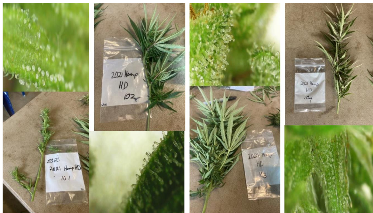
Image 1. Harvest date 1 pictures for harvested cola, flower pistils, and trichomes of Forbidden V, Bhutan Glory, Lifter and JM cultivars (pictured from left to right).