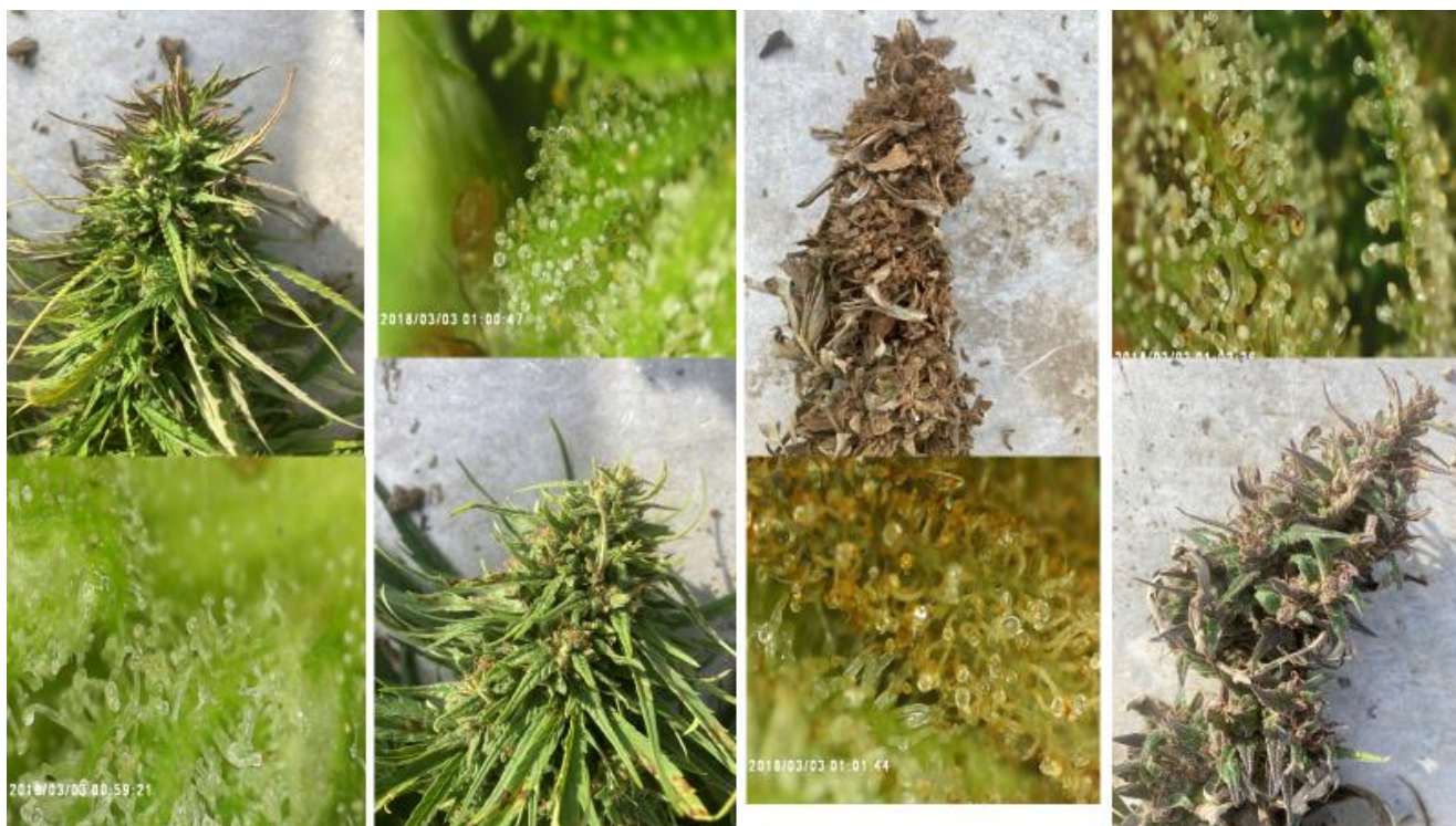
Image 4. Harvest date 7 pictures for harvested cola, flower pistils, and trichomes of Forbidden V, Bhutan Glory, Lifter and JM cultivars (pictured from left to right).