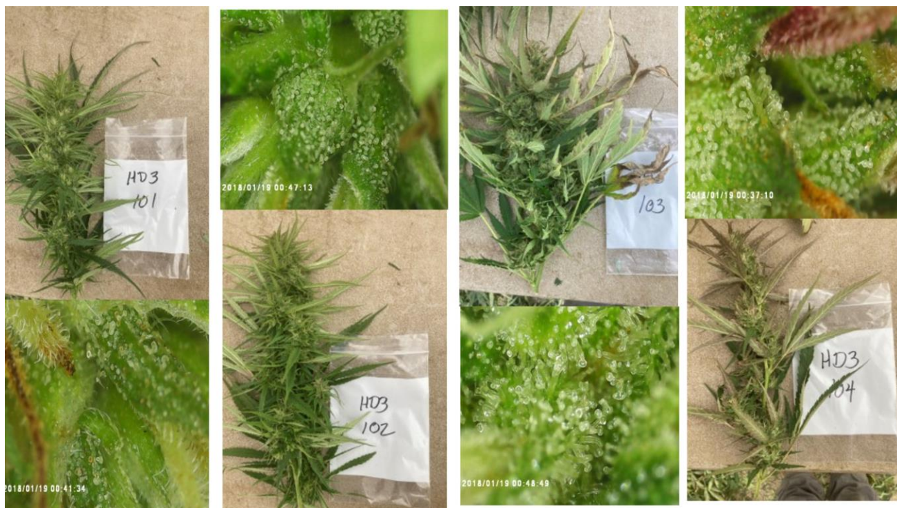
Image 2. Harvest date 3 pictures for harvested cola, flower pistils, and trichomes of Forbidden V, Bhutan Glory, Lifter and JM cultivars (pictured from left to right).