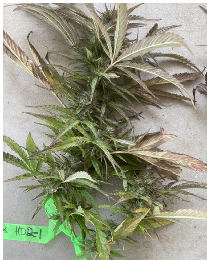
Cherry Blossom HD2