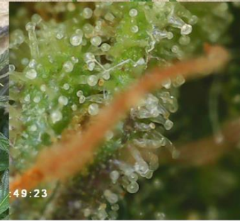
Image 3. Harvest date 3 pictures for harvested cola, flower pistils, and trichomes of Boax, Cherry Blossom, and Southern Sunset cultivars.