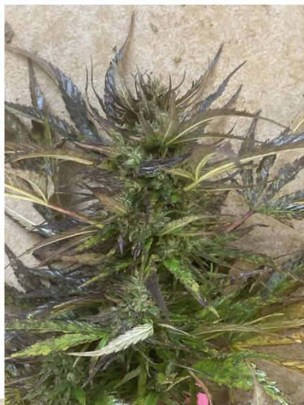
Cherry Blossom HD4