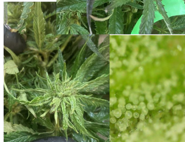
Image 4. Harvest date 4 pictures for harvested cola, flower pistils, and trichomes of Boax, Cherry Blossom, and Southern Sunset cultivars.