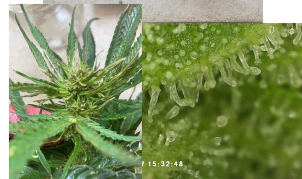
Image 2. Harvest date 2 pictures for harvest cola, flower pistils, and trichomes of Boax, Cherry Blossom, and Southern Sunset cultivars.