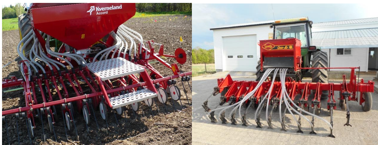
Image 1. Kverneland grain drill (left), Gandy air seeder (right), Alburgh, VT.

The NARROW row treatment was planted with a Kverneland grain drill (Image 1). The WIDE row treatment was also planted with a Kverneland grain drill (by plugging every other hole in the hopper for 9" row spacing). The STANDARD treatment was planted with a Sunflower 9412 no-till grain drill (Image 2). The BANDED treatments were planted with a custom built seeder that was made from a 12 row International row crop cultivator, and converted to an air seeder using a Gandy and a 6212 air box. Parallel linkage units were mounted 12" apart and mounted with precision Dutch openers that created 5" banded seed rows and 6" between rows (Image 1). The WIDE and one of the two BANDED treatments were cultivated with a Schmotzer hoe on the 16-Jun. The Schmotzer hoe, imported from Germany, is a manually-guided, rear-mounted implement that can be used to cultivate in-between wide rows of flax (Image 2). This allows weed control to take place later in the growing season, after plants are well established.