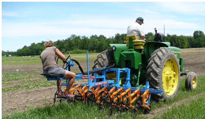
Image 2. Sunflower grain drill (left), Schmotzer hoe (right), Alburgh, VT.

Weed cover was assessed as a percent of total plant cover using the web based IMAGING crop response analyzer. Digital images were taken with a compact digital camera, Canon PowerShot G12 (Melville, NY) (10.4 Megapixels). For all treatments, one picture covering approximately 0.25 m 2 was taken in each plot before weeding and one picture was taken after cultivation. Digital images were analyzed with the automated imaging software, which was programmed in MATLAB (MathWorks, Inc., Natick, MA) and later converted into a free web-based software ( www.imaging-crops.dk ). The outcome of the analysis is a leaf cover index, which is the proportion of pixels in the images determined to be green. Total plant cover (1 st picture) – flax cover (second picture) / total plant cover = weed cover (%). Weed populations were also counted by hand for all treatments after cultivation.