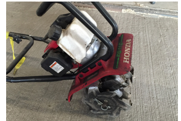
Figure 4: Honda FG 110 Mini-tiller.

The replicated research plots were located at Borderview Research Farm in Alburgh, VT on a Benson rocky silt loam. The experimental design was a randomized complete block with three replicates; treatments were steam, herbicide, till, and mulch.