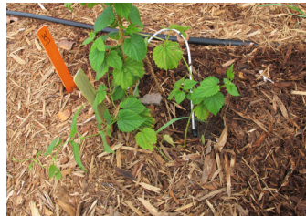
Figure 3: Hardwood mulch.