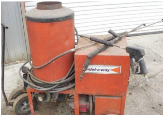
Figure 1: Steam Jenny pressure washer.

As for any perennial crop, managing weeds can require significant time and resources. Growers are looking for weed management methods that are effective, quick, and affordable. There are few herbicides labeled for use in hop production for VT and the region. Hence, growers are looking for alternative strategies to control weeds in hops. The main methods of control for weeds in the UVM hop yard have been hand weeding and mulch applications. While relatively effective, hand weeding has taken as much as 200 cumulative hours of labor per acre per year. In 2015, four alternative weed management methods were compared in the UVM hop yard including steam weeding, mulching, tilling, and applying a certified organic citrus-based herbicide.