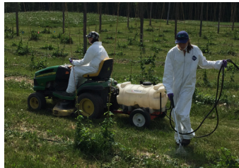
Figure 2: Spraying Avenger herbicide.