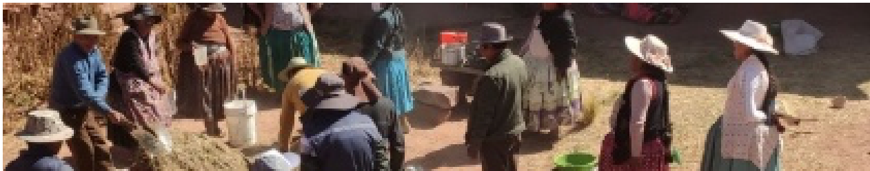
Image 4: Communal bokashi making in Villa Anta. Photo credit: Roly Cota. (2023).

Incorporating collective action into agroecology transitions offers new opportunities to support autonomous community transformations. In the selected communities, community action was key to agroecological transitions, facilitated by PROSUCO through a participatory approach. Communities identified priorities, such as improving soils and water resources, promoting the production of bio-inputs, and expanding their changes with the diversification of activities. Using the UVM Institute for Agroecology's transition framework allowed us to define goals and align around a common understanding of agroecology. The transition processes that took place in these communities also highlighted the importance of strengthening collective action joined to Andean traditional norms, such as ayni. Agroecological transitions are not linear or uniform, but complex processes that require adaptability and continuous learning from the perspective of communities. The lessons learned emphasize the need to address agroecological transitions with transdisciplinary approaches based on local values, fostering coalitions, prioritizing the collective, and – in this context – promoting Andean cosmivision. Participatory research is valuable for understanding the context, defining goals and strategies, and analyzing learnings to achieve effective and sustainable transitions.