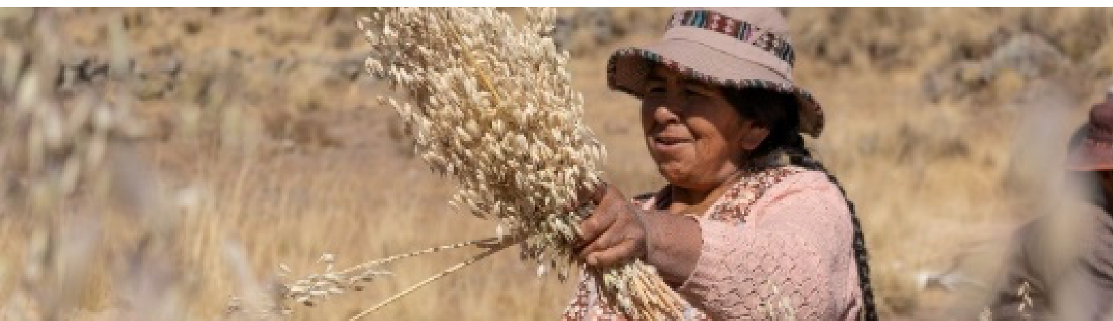
Image 3: Farmer from Chigani Alto harvesting oats.

3. Agrobiodiversity Groups: Through gatherings where community members compared varieties and discussed desired characteristics, participants experienced the importance of a diversity of seeds and plants. In Chigani Alto, the exploration extended to fruit trees (apples) and forests, in addition to Farmer Researcher Network tests, and the planting of crops such as tarwi (lupine), cañahua (Andean grain), quinoa, and grain oats (Image 3). In Chigani Alto and Villa Anta, a new variety of potatoes called "Jatun puka" was provided, which has a precocious habit, and can be harvested quickly. When also amended with bokashi, it requires less water for its development. In Villa Anta, the use of bokashi (Image 4) was promoted to complement the use of guano. The producers expressed satisfaction with their experiments because – in the words of one farmer "the potatoes came out large and without worms."