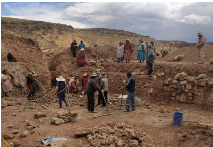
Image 2. Ayni in Chigani Alto for the construction of the qutaña or water reservoir.

2. Water Source Groups: All three communities identified the need to improve access to water. For example, in Chigani Alto, a qutaña (water reservoir) was built collectively to store water to provide irrigation to the plots. In Villa Anta, rainwater harvesting was implemented using ferrocement tanks for human and animal supply. Finally, in Cebollullo, community members organized around cleaning communal irrigation ditches.