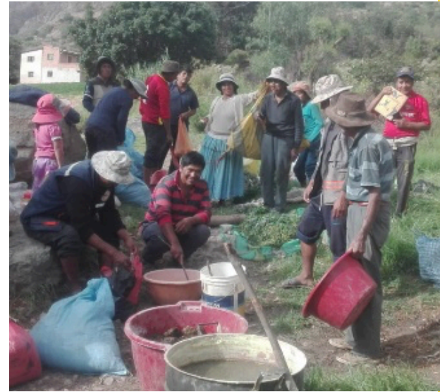
Image 1: Making sulpho-calcium broth in Chives. Photo credit: Roly Cota. (2023).

- Interview with a farmer in Cebollullo, 2023