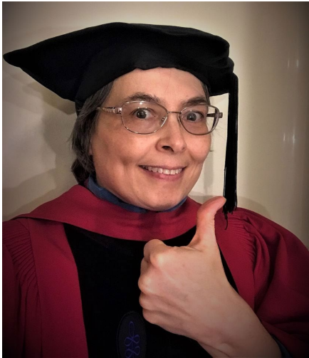
“Way to go! Best wishes on your next adventure!” Professor Shea