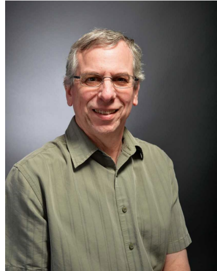
“Good luck with the next step in your careers! You are more than statistically significant!” Professor Callas