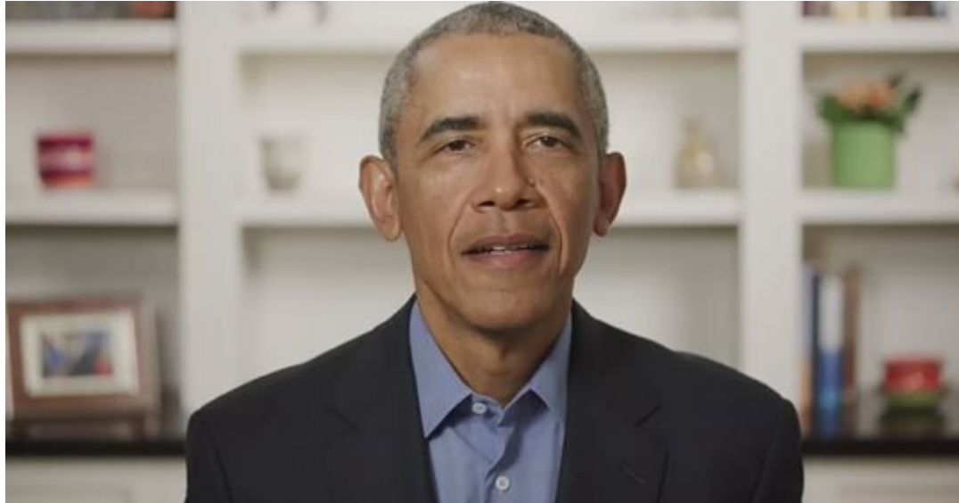
Mr. President, Professor Barack Obama